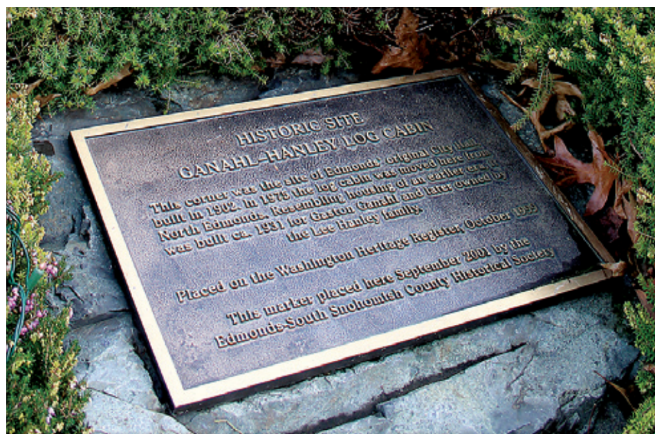
An inscription in front of the Log Cabin Visitors Center was placed there in 2001 by the Edmonds-South Snohomish County Historical Society.