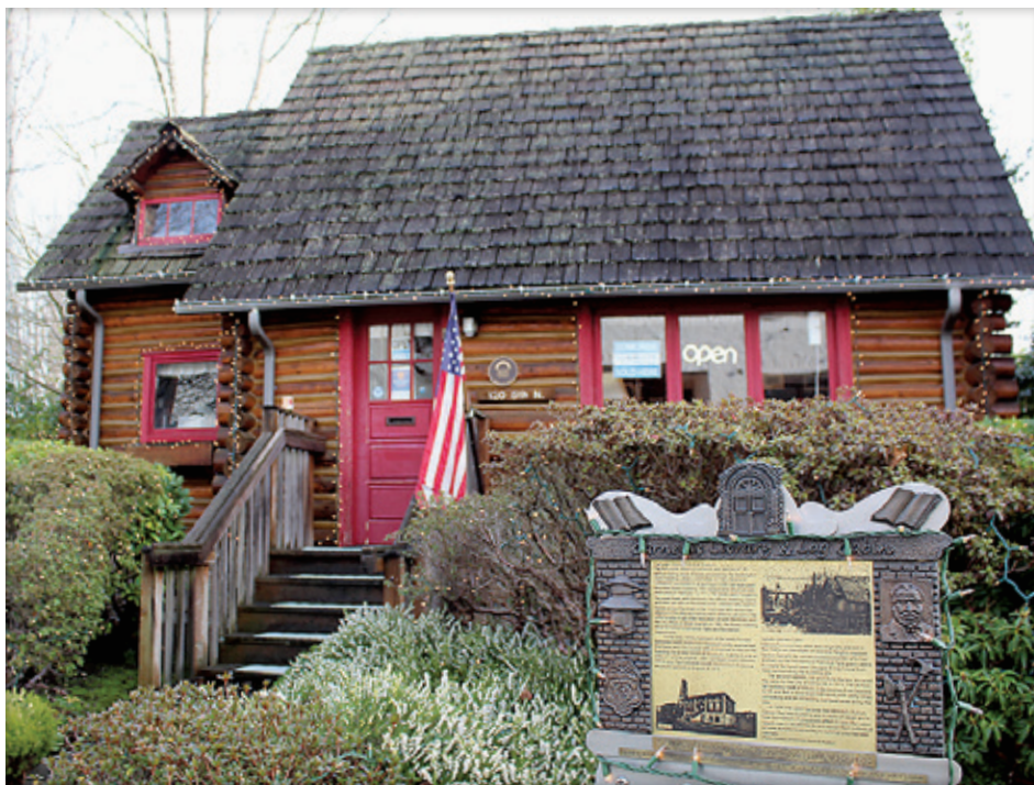
Beacon photos by Brian Soergel