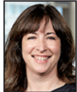
BY MARIA A. MONTALVO EDMONDS FOOD AND ART CONNOISSEUR

After the dud that was last year's COVID-infused non-celebration, this is a conversation many of us are having these days, but luckily, there are several options around town for a delectable and festive holiday.