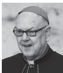
Cardinal Fernando Sebastián Aguilar

Born in Calatayud, Spain, he joined the Claretians at age 15. He was ordained in 1953 and