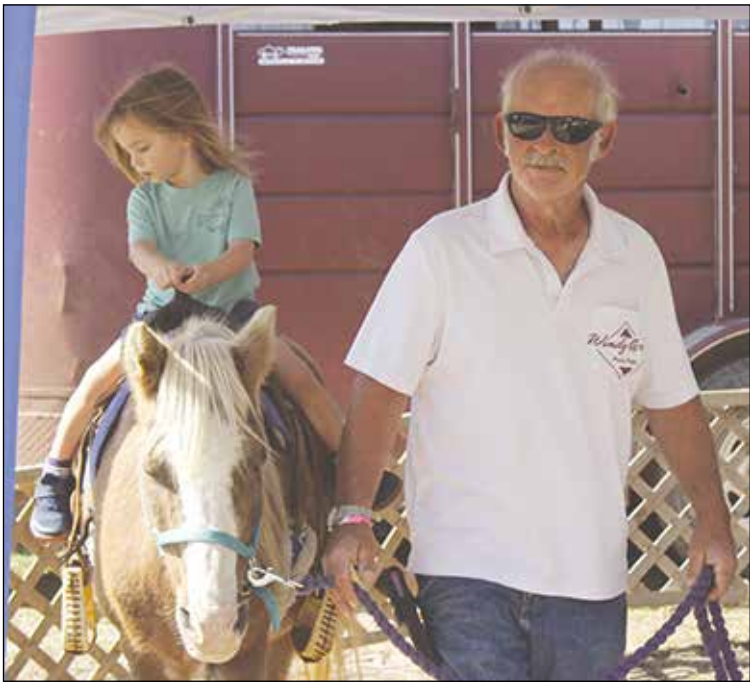
Every kid wants a pony ride, and plenty of kids got their turn this weekend.