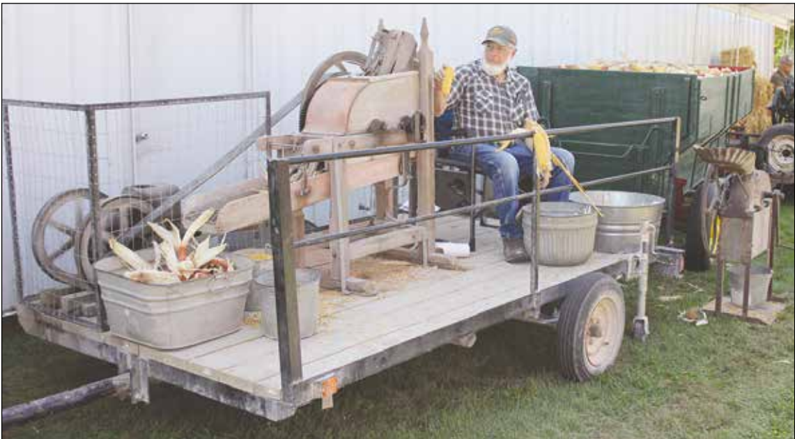
Watching corn trimmed right off the cob was a fascinating demonstration.