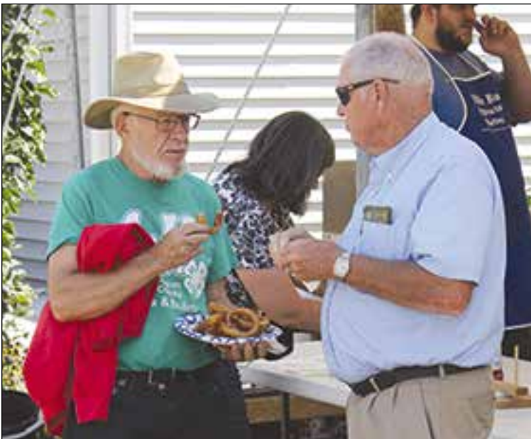
Onion rings are just one of many festival foods visitors look forward to each year.