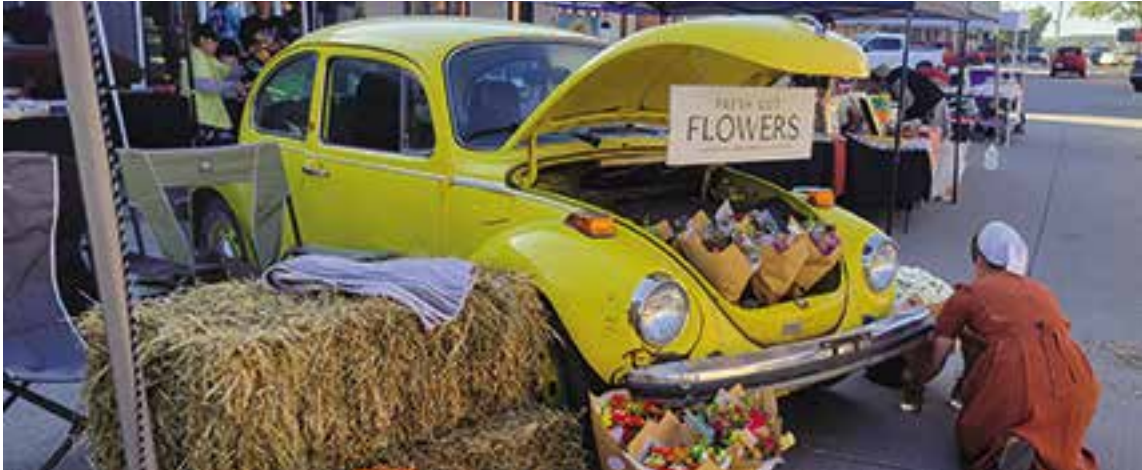
Gorgeous locally grown blooms filled a VW Bug Saturday morning at the Kalona Farmers Market. Just one more market remains this season; be sure to peruse the goods on Saturday, Oct. 11.