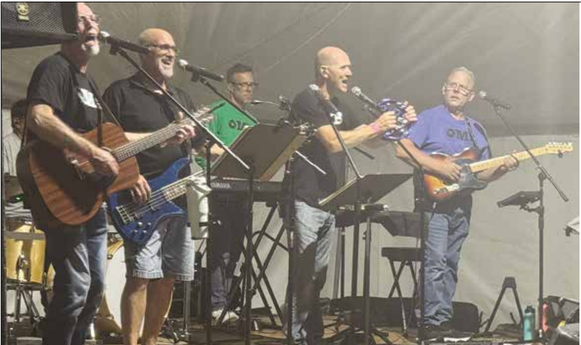
Old Man Band performed Friday evening.