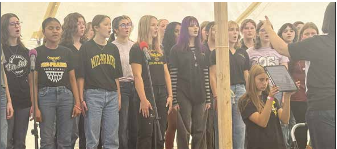
A musical performance by Mid-Prairie students Friday.