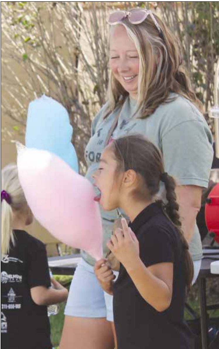
That first taste of cotton candy is a distinct pleasure.