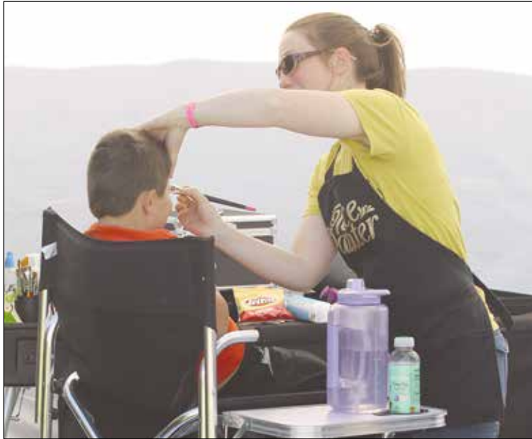
Face painting brought joy to many.