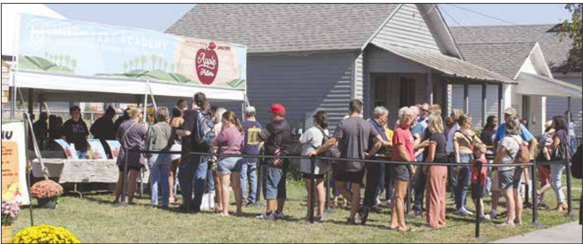
A favorite Fall Festival tradition: comparing how long the wait was in line for Hillcrest Academy's apple fritters.