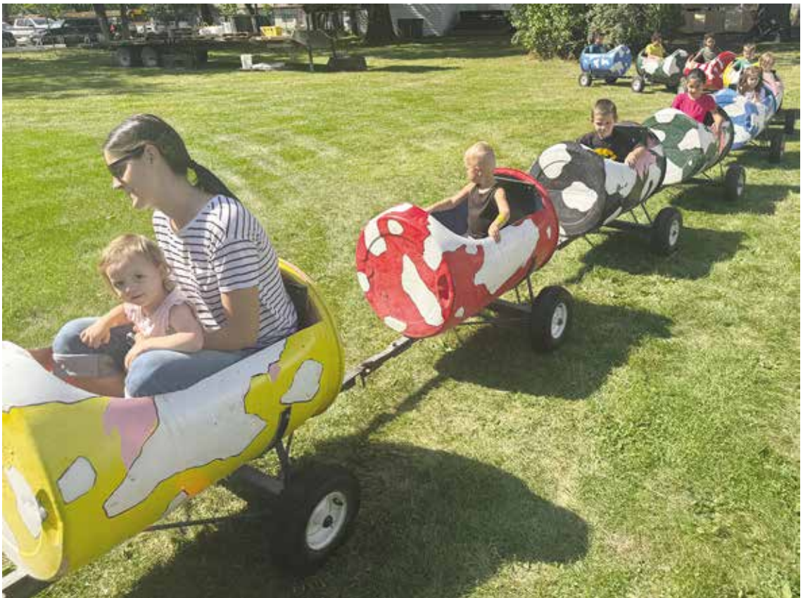
Train rides are always fun at Fall Festival.