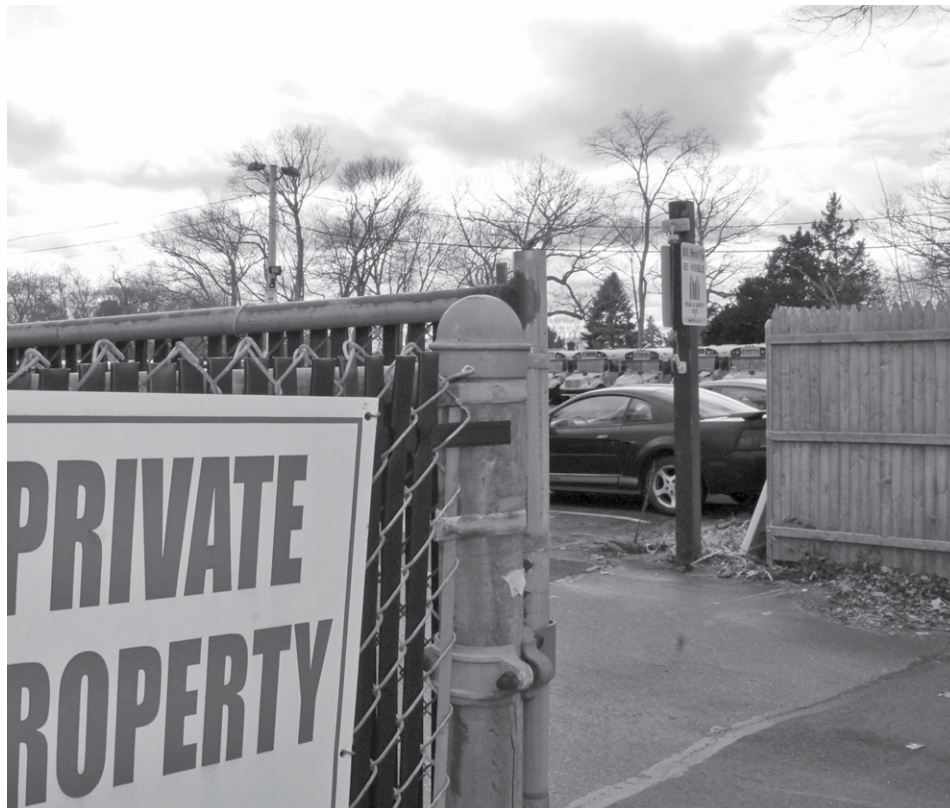
Buses that enter and exit on Kreamer Street are causing a noise disturbance, say residents.