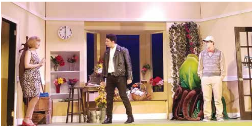
In a classic love triangle with the bad boy and the good guy, Audrey is torn between Skid Row and “somewhere that’s green.”