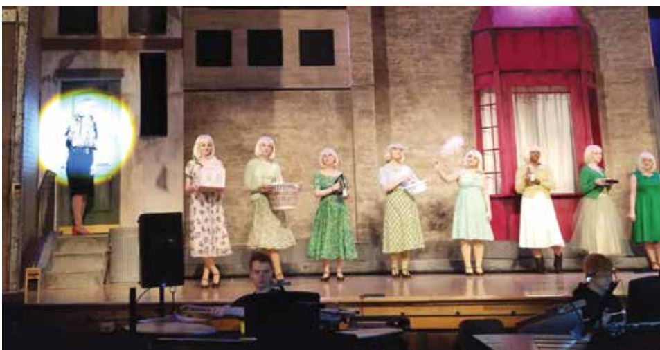
A chorus of “Audreys” assembles for the audience to get to know the dreams of the woman stuck in this rough neighborhood.