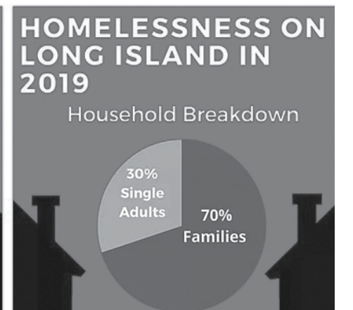
Each January, the Long Island Coalition for the Homeless coordinates point-in-time counts of sheltered and unsheltered homeless men, women and children in Nassau and Suffolk counties. The 2020 count took place on Jan. 22, though numbers are not yet available.