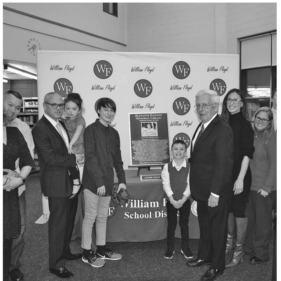
The Dawson family celebrates the renaming and dedication of the William Floyd High School library to the Jeananne Dawson Memorial Library.