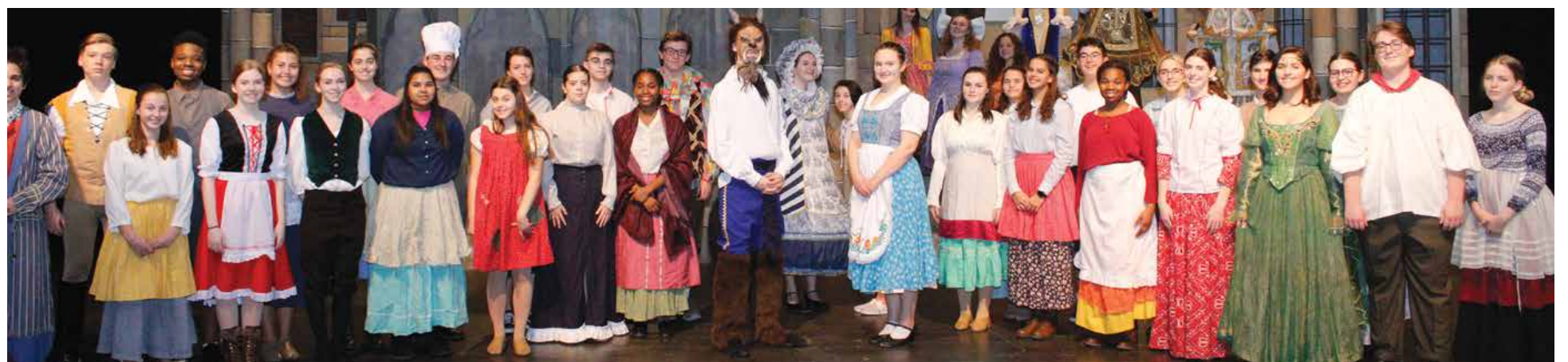
The full cast of “Beauty and the Beast” at Bellport High School features more than two dozen students of various grade levels.