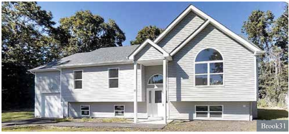
Riverhead—$649,900 Nothing like new construction! Spectacular 3 bedroom, 2 bath raised ranch with master suite and bonus room!