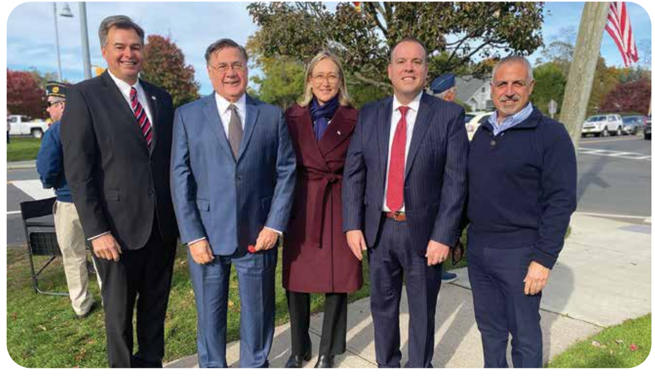
Elected officials march in the parade and thank veterans for their service.

Pictured is the newly installed Walk of Heroes, by the VFW. The VFW still has room for bricks and encourages anyone to go on their website and donate a brick in honor or memory of a loved one.