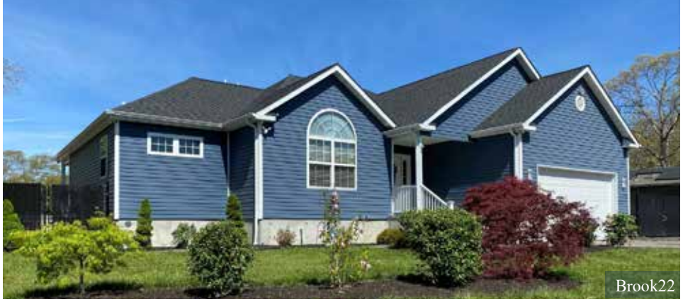
Mastic Beach—$559,900 Modern and elegant, 5 bedroom, 3.5 bath custom built including stunning inground pool! Must see!