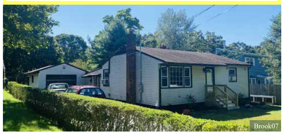
Center Moriches—$399,900 Cute, 2 bedroom, 1 bath ranch on quiet street close to Webby's Beach and Main Street amenities.