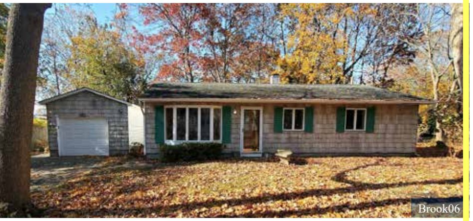
Sunlit, 3 bedroom ranch, close to town! Private, fenced-in yard with detached garage in great neighborhood. Move in ready!