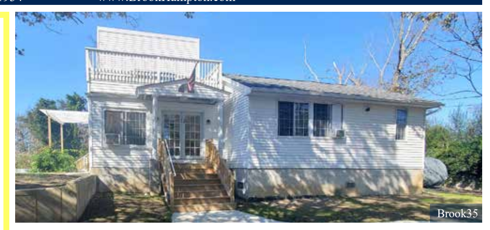
Brookhaven—$729,000 A Brookhaven Hamlet treasure! Unique, 3 bedroom, 2 bath expanded ranch! Possible mother/daughter.