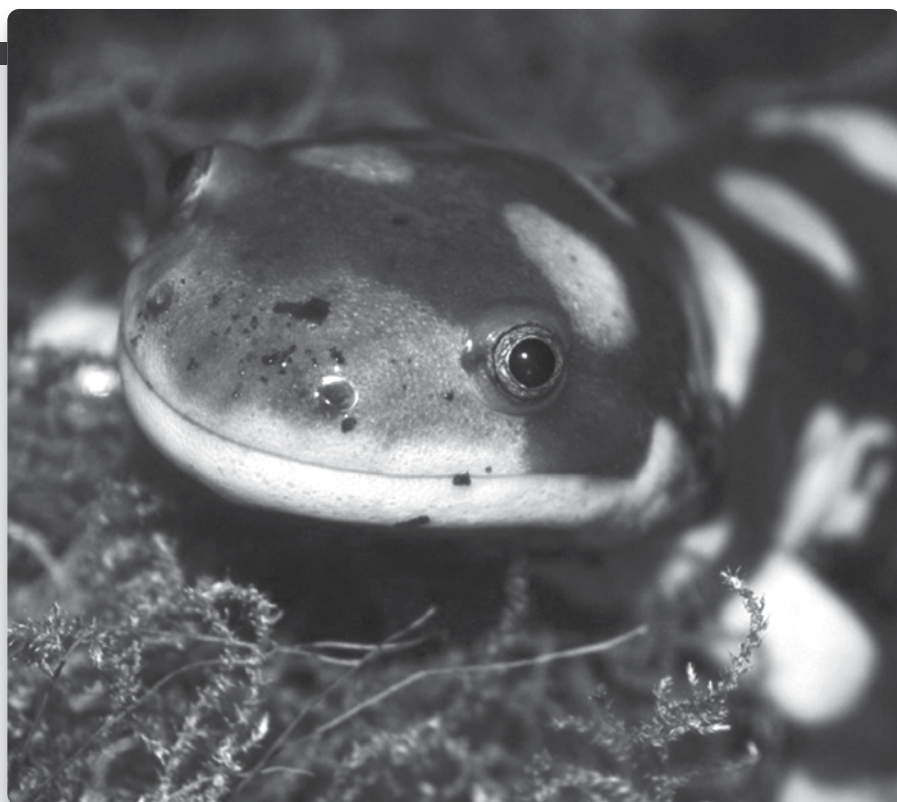
Species like the eastern tiger salamander will be further protected, thanks to a Long Island Community Foundation grant.

Is helping in the revitalization of East Patchogue one of your New Year's resolutions? If so, Focus East Patchogue always welcomes new members (there is no membership fee or required in-person meetings). If you are interested in joining the group or to find out more information, please send your contact information to focuseastpatchogue@gmail.com . ■