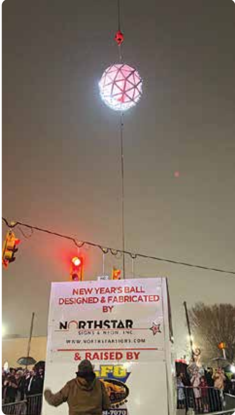
Since Patchogue is always ahead of its time, it's no wonder that the ball rose at the more family-friendly hour of 9 p.m. ADV/Braff