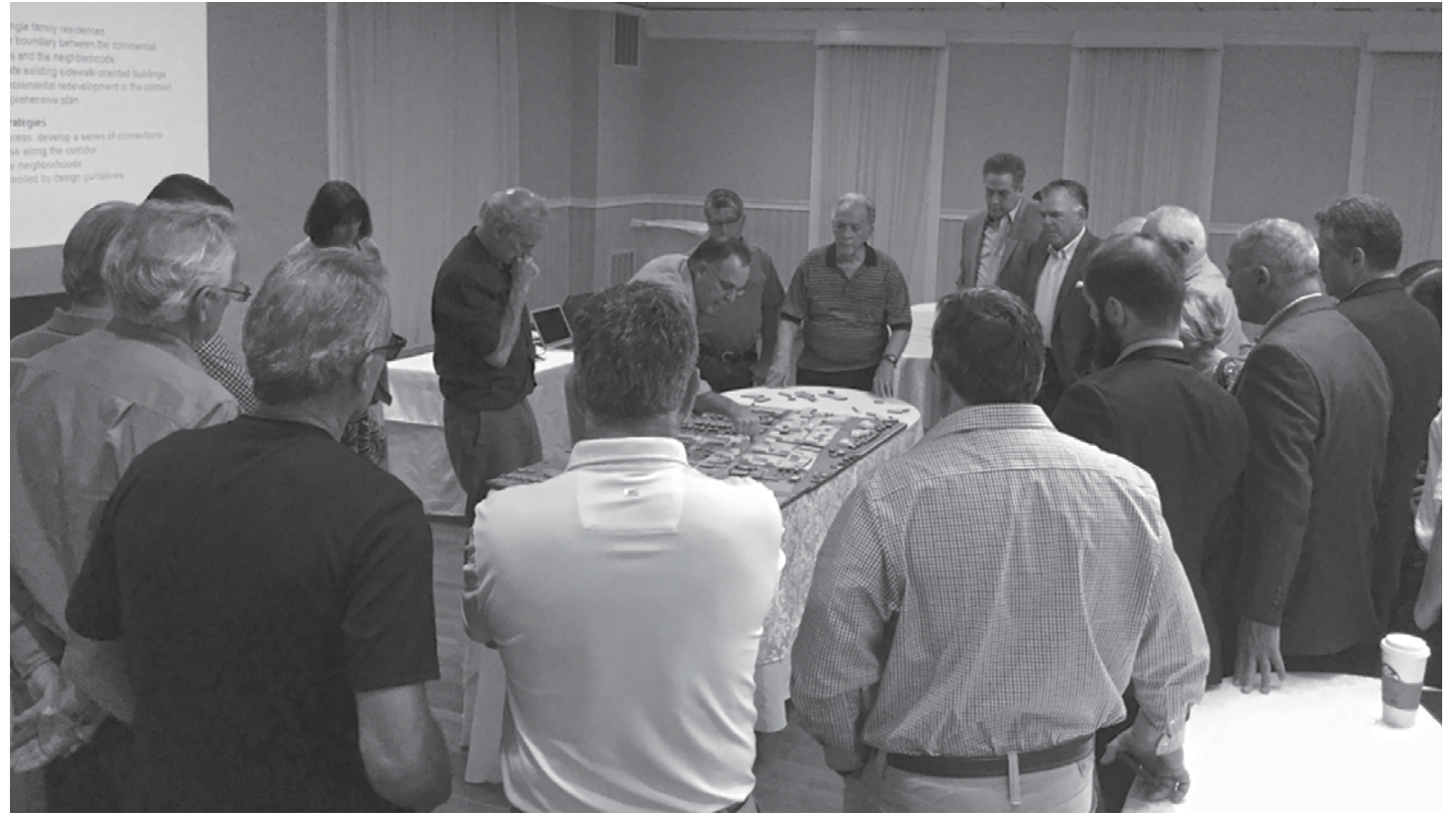
Focus East Patchogue is a group of concerned volunteers who are residents, business owners, and professionals. The organization has been working for more than three decades to improve and revitalize the unincorporated area of Patchogue located to the east of Patchogue Village.

East Patchogue has flourished in recent years, due in no small part to the tireless dedication and sustained efforts of Focus East Patchogue, work-