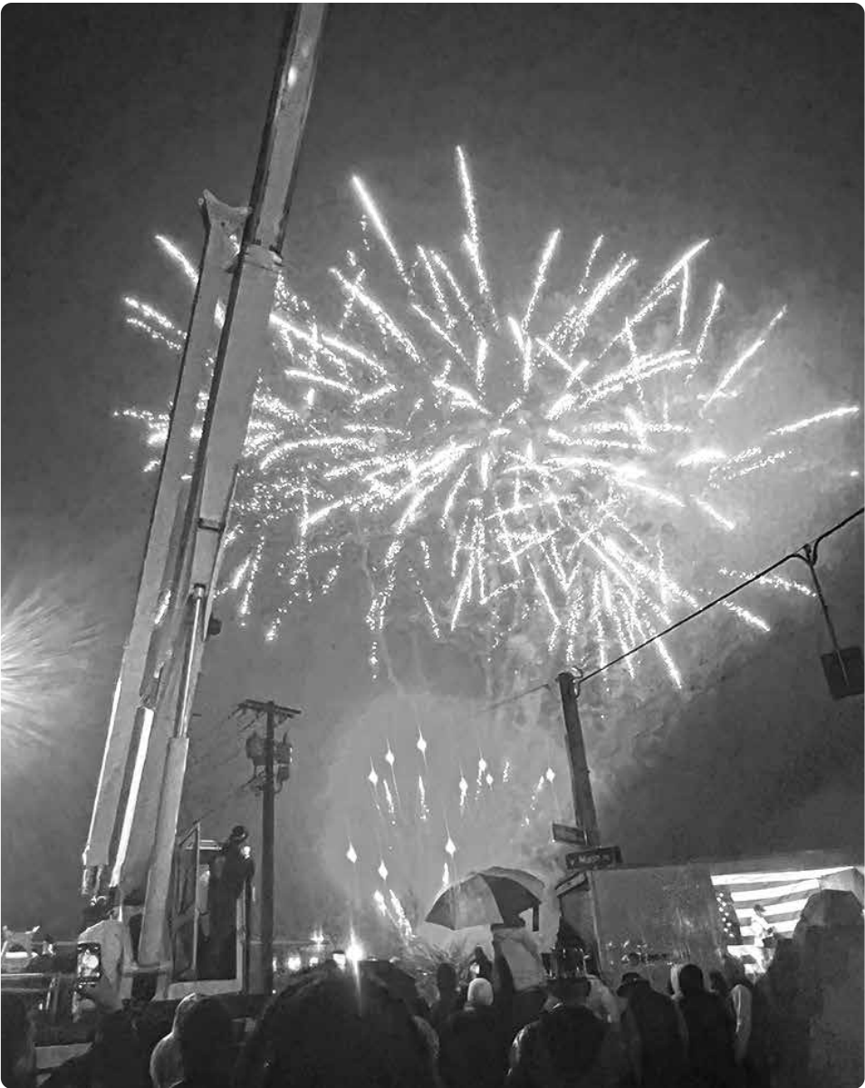
An impressive Grucci fireworks display, which was the biggest one in Patchogue yet, was a phantasmagoria of light and color to ring in the mock midnight.