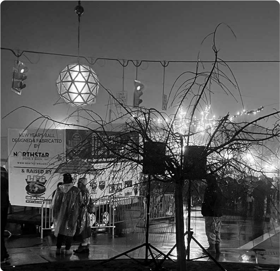
Patchogue’s impressive, multi-colored New Year’s ball was designed and fabricated by NorthStar Signs & Neon and raised by LFG Rigging.