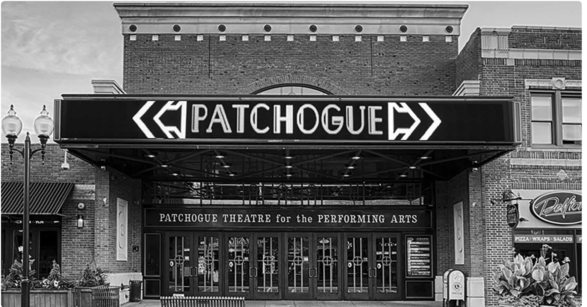
The Gateway will continue in Bellport, but will not have productions at Patchogue Theatre.