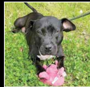
Maggie - 5 Year Old Female Pit Mix