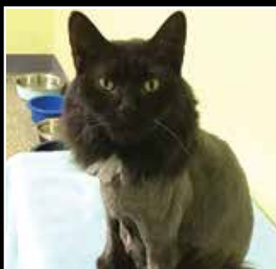
Rudy - 7 Year Old Female Domestic Cat