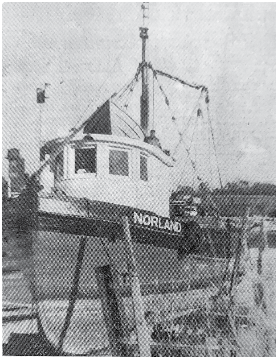
From the Jan. 8, 1948 edition: The trawler Norland , which went aground in the ocean surf near the Bellport Coast Guard Station recently, is now undergoing repairs at the South Bay Boat Works yard on the Patchogue River. Vessel was transported across Great South Beach by Davis Brothers Engineering Corp., of Blue Point, using large cradles for the project.