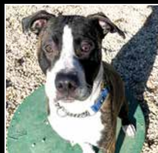
Hanson - 8 Month Old Male Pit Mix