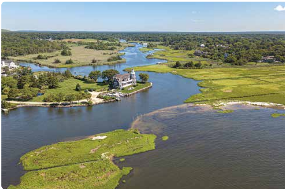
An image of Bellport Bay and Fireplace Neck salt marsh.