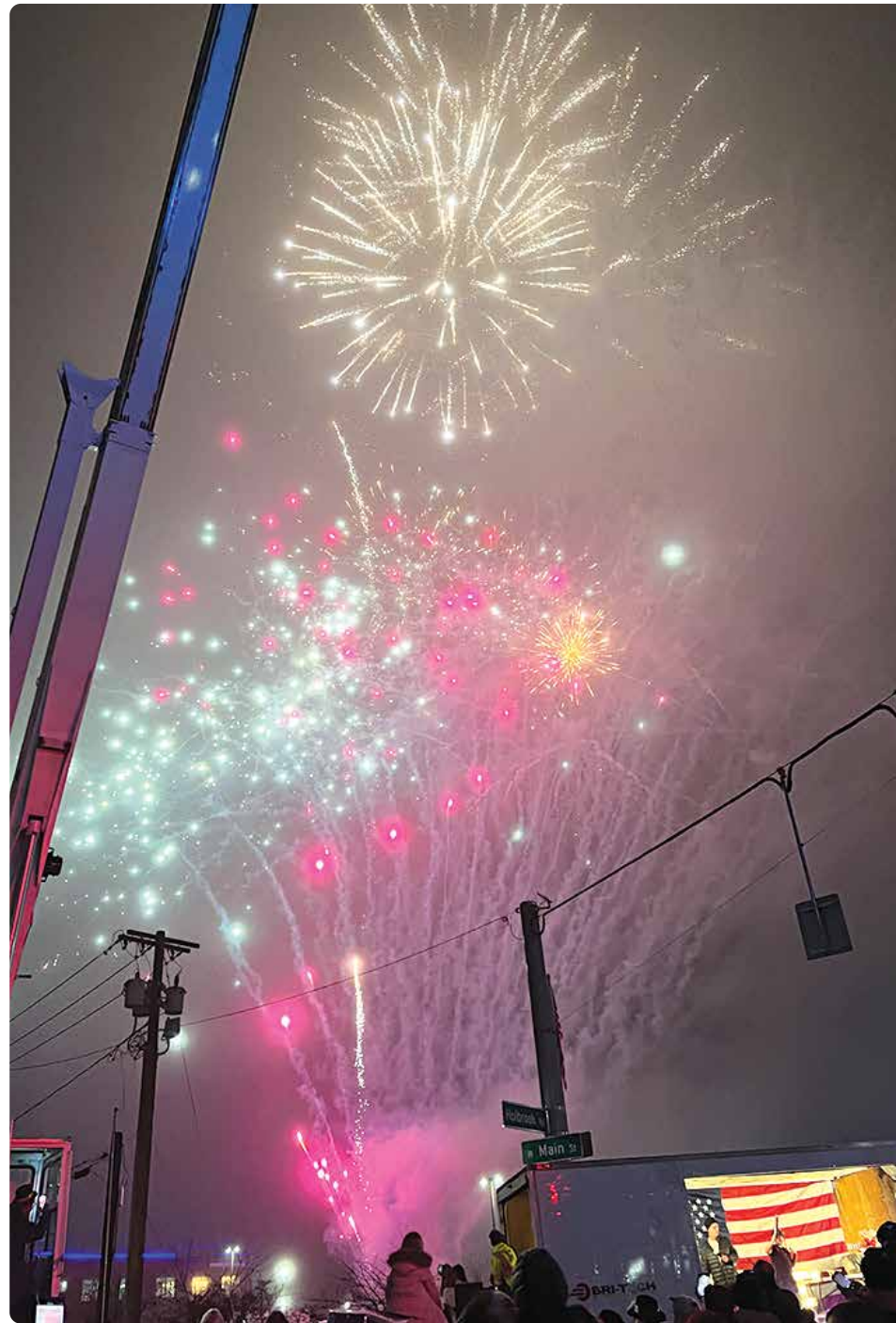
Grucci fireworks, from Midnight on Main, welcoming 2023 in Patchogue.

In Shirley, Romaine wants to begin construction on the 99 acres of town-owned parkland in the area and see a walking and exercise trail come to fruition around the pond, for those whose personal resolutions include getting in better shape or maintaining physical and mental fitness, while enjoying the natural beauty of the area in which they live. Parking and public restrooms would also be included in the comprehensive plan, which will eventually involve several sports fields built with-