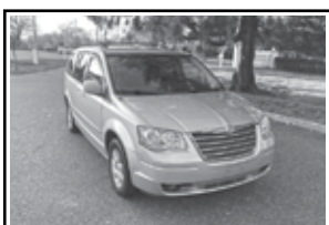
2010 CHRYSLER TOWN & COUNTRY 169,000 MILES - $5,750