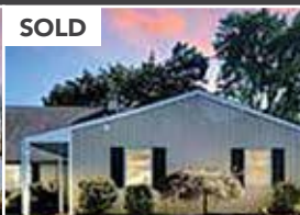
Port Jeff Station