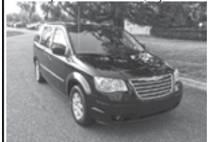
2010 CHRYSLER TOWN & COUNTRY 175,000 MILES - $5,650