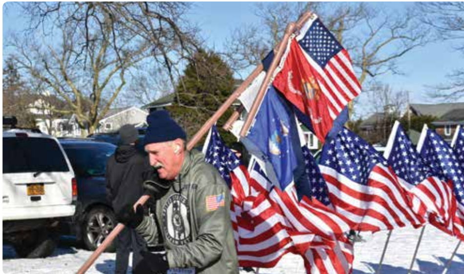
A determined Vietnam veteran raced while carrying patriotic flags.