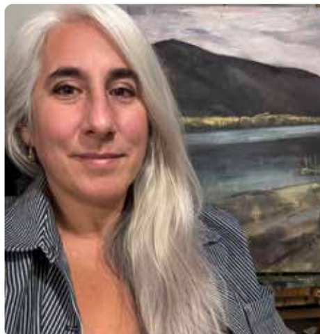
Syd Glasser's prints and paintings often depict figures, horses, and landscape, combining abstract and representation.