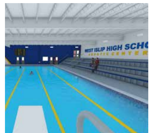
Artist rendition of approved pool.

Moving forward, the project will be submitted to the New York State Education Department for approval. The West Islip Union Free School District will apply for New York State Building Aid reimbursements, and a final bid will