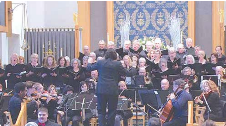
Island Symphony Orchestra is once again bringing their musical talent to St. Peter’s-by-the-Sea Episcopal Church on Sunday, Jan. 28, at 2 p.m.