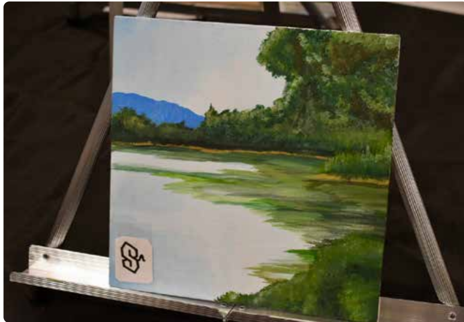
“Serene Greens,” created by eighth-grader Samia Ahmed, is a beautiful acrylic nature scene.