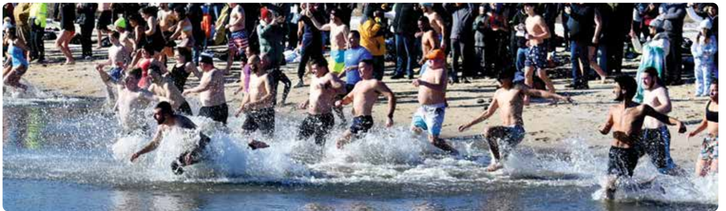
VEST's third annual 22 Degree Run and Plunge featured a 2.2-mile race and polar plunge at Walker Park in Brightwaters.