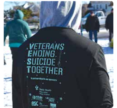
The nonprofit organization Operation VEST aims to eradicate veteran suicide, one life at a time, by destigmatizing mental health issues and teaming up with local veteran organizations.