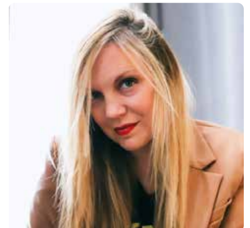
Inspired by her childhood and forgotten memories, Holly Hunt's photography transports viewers to abandoned places they would not dare to venture on their own.