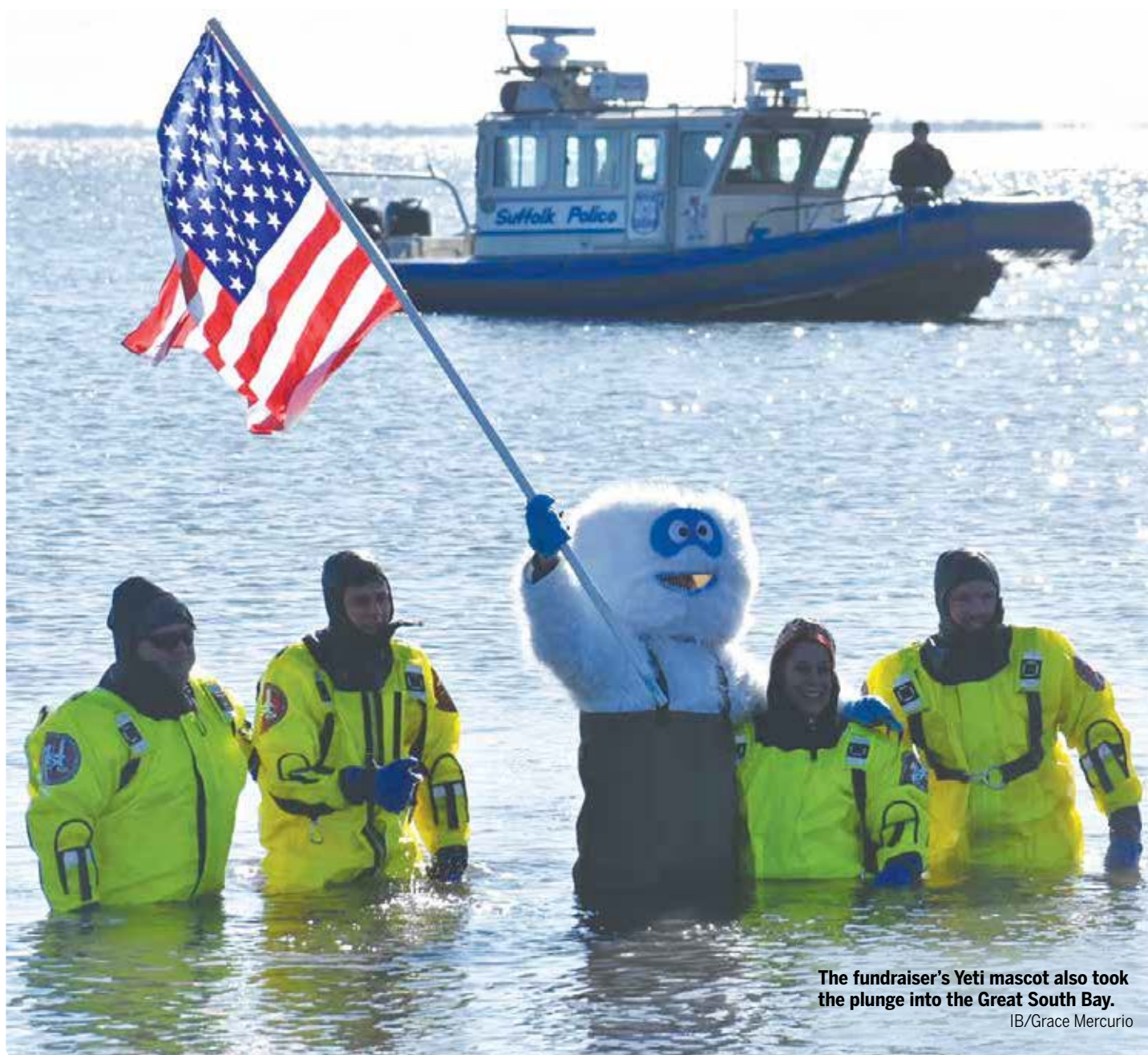
The fundraiser's Yeti mascot also took the plunge into the Great South Bay.