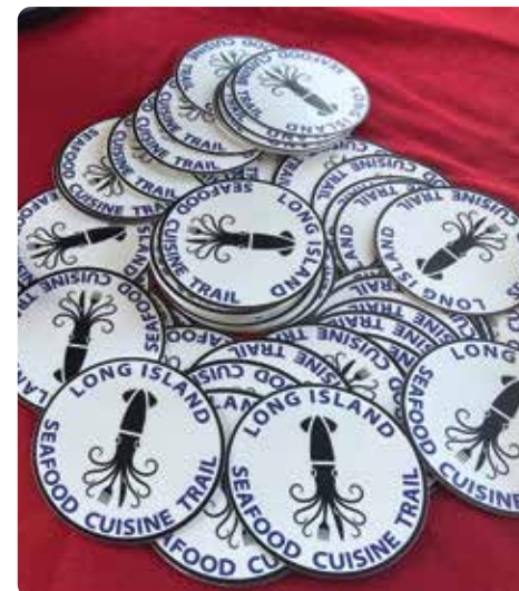
Promotional materials handed out at Wednesday's press conference.

Visitors want to try Long Island's famed local seafood, but they don't always know where to find it, Reynolds