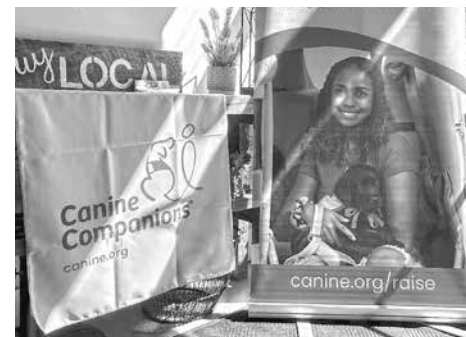
Puppy raisers are volunteers who help support, socialize and train the puppy.