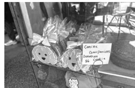
Cookies were sold to help support the organization.