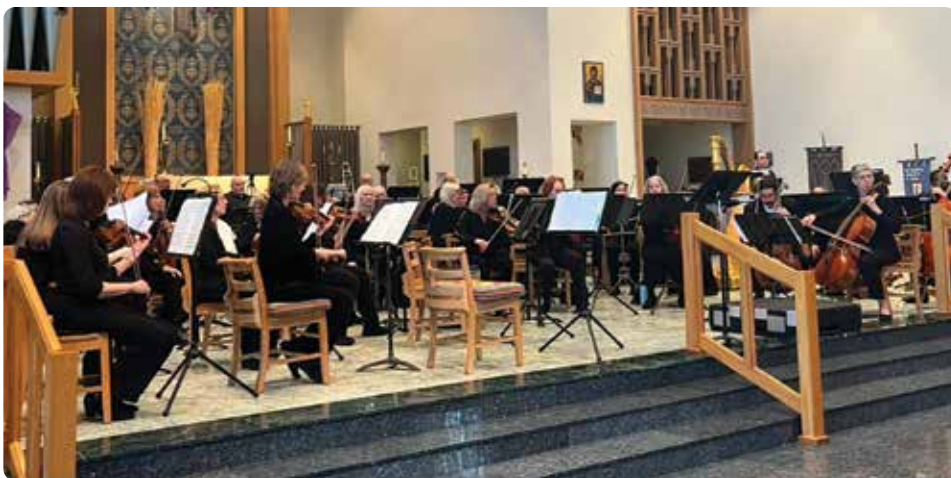
Members of the Island Symphony Orchestra warm up for their 2025 Spring Concert, which celebrates the coming of Spring and the many beautiful birds on Long Island.