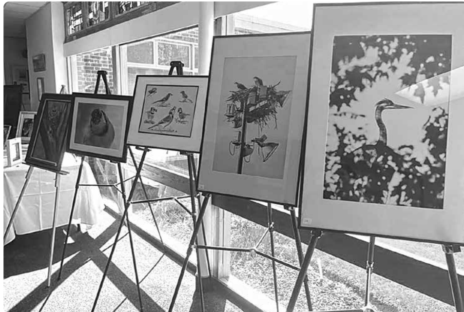
A display of stunning bird photos.

Next, there is a central section, which is marked animato. This slightly more upbeat section uses techniques such as double tonguing and decorations, making the solo part much more difficult. The speed is part of what makes the work fiendishly tricky. An interlude