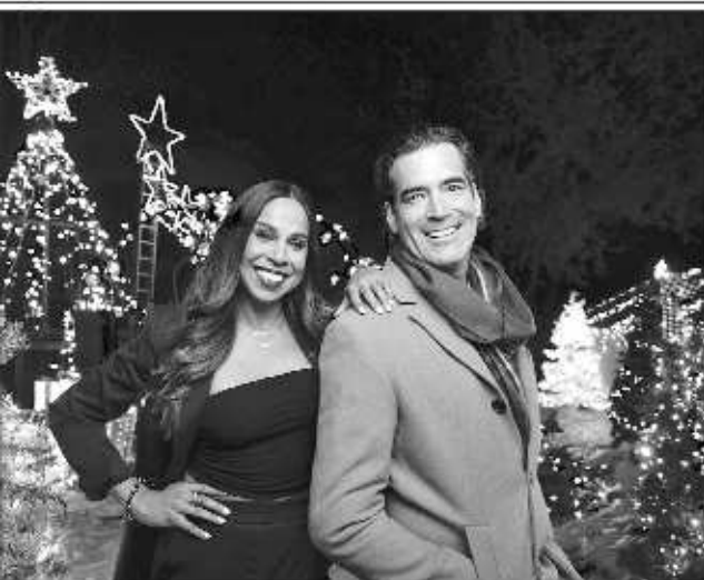
Tanya Nayak and Carter Oosterhouse host "The Great Christmas Light Fight"