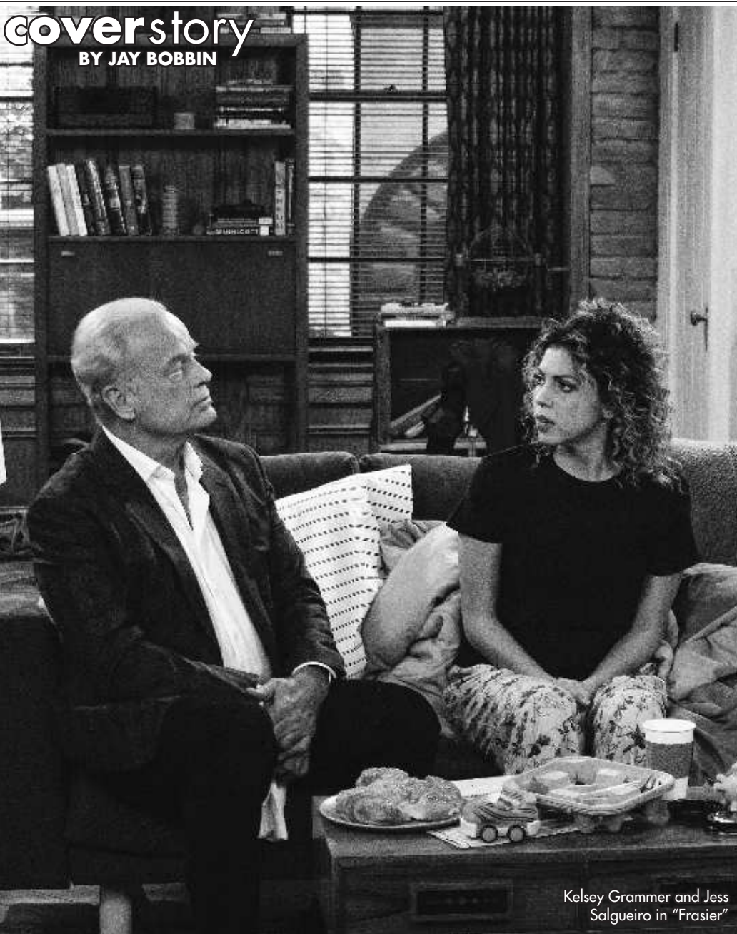
Kelsey Grammer and Jess Salgueiro in "Frasier"