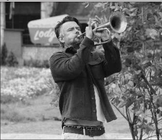
Josh Duhamel from "Buddy Games"