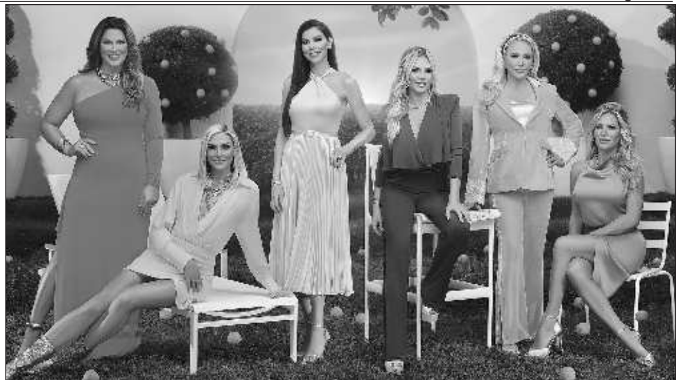
The Season 17 cast of "The Real Housewives of Orange County"

This new episode dives into sunken treasures as a survey flight over Turkey's Lake Iznik unexpectedly reveals the preserved remains of a fourth-century basilica.