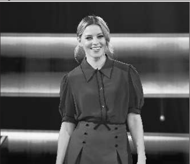
Elizabeth Banks from "Press Your Luck"