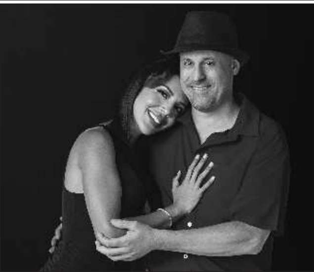
Jasmine and Gino in "90 Day Fiancé"