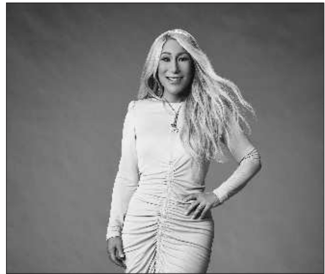
Lori Greiner from "Shark Tank"

This Season 4 premiere brings back the beloved anthology based on George A. Romero's 1982 horror-comedy classic — a comic book that comes to life in a series of vignettes, exploring terrors in a tongue-in-cheek and tongue-ripped-from-the-head narrative.