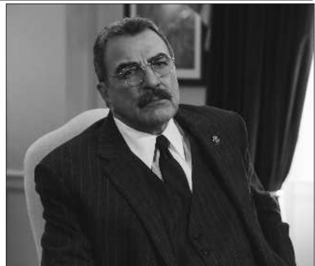
Tom Selleck in "Blue Bloods"

Take a seat at the Regan family dinner table — no, really, there's a spot for you. The first of many viewer-voted (and fan favorite) episodes from this family-focused police drama airs, beginning a slate of classic episodes chosen by fanatics at home.