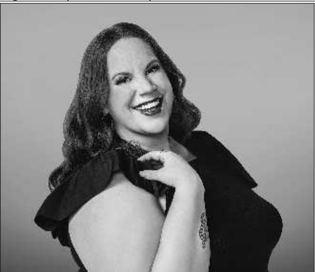
Whitney Way Thore from "My Big Fat Fabulous Life"