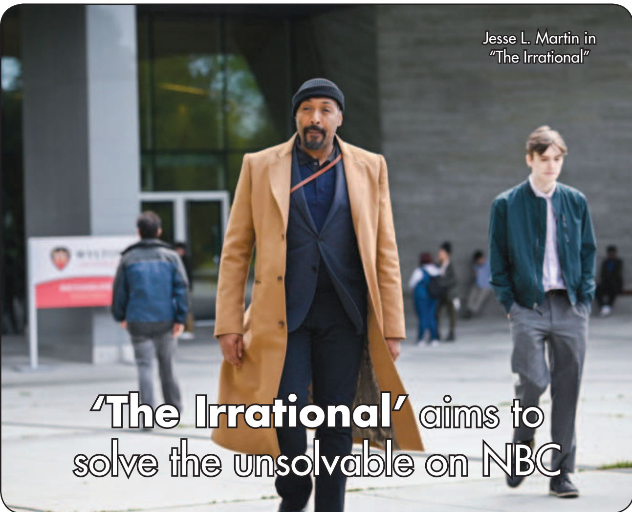
Jesse L. Martin in "The Irrational"

TV Listings for the week of September 24 to September 30