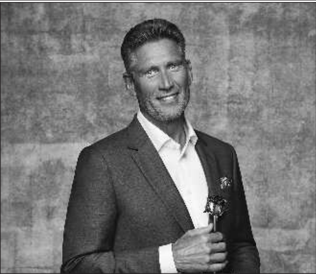
Gerry Turner from "The Golden Bachelor"