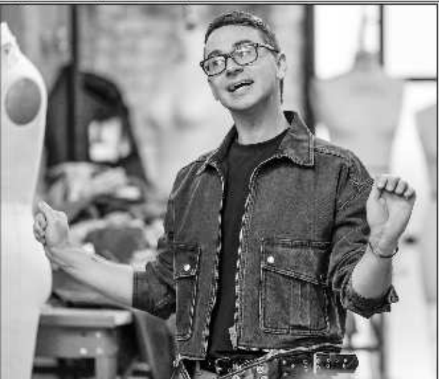
Christian Siriano from "Project Runway"