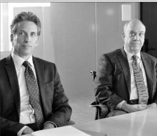
Ben Shenkman and Paul Giamatti in "Billions"