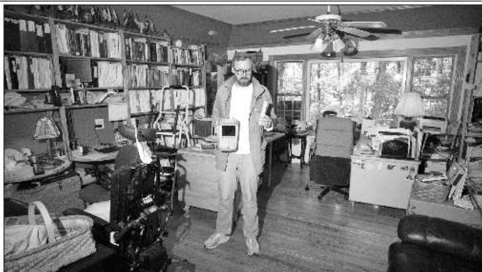
John Wilson from "How To With John Wilson"

The third and final season of this odd (and often surreal) docuseries continues, as filmmaker John Wilson embarks on one final odyssey of self-discovery and observation by covertly filming the reactions of fellow New Yorkers while he shares advice.