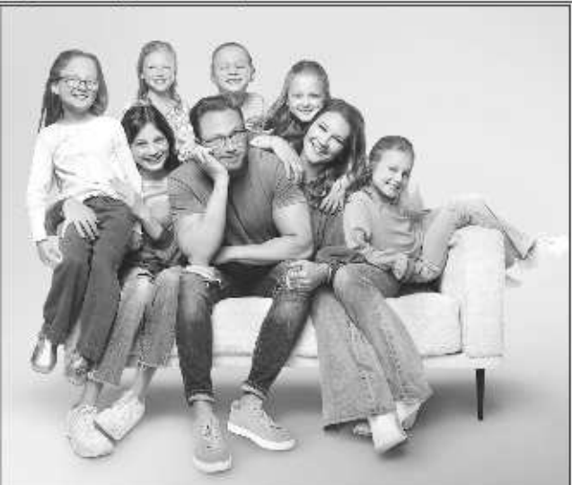
The family of "OutDaughtered"