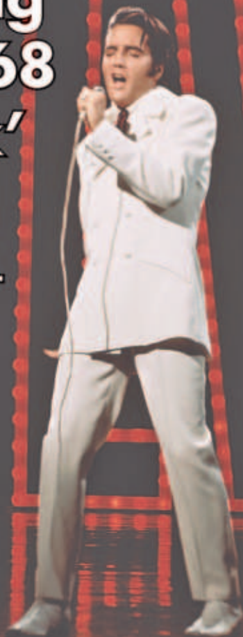
Elvis Presley, as seen in "Reinventing Elvis: The '68 Comeback"

'Reinventing Elvis: The '68 Comeback' debuts on Paramount+