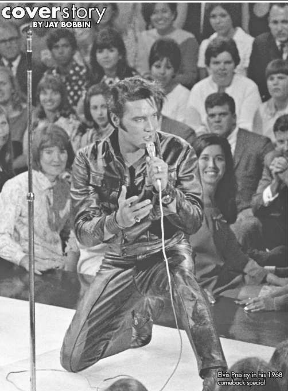
Elvis Presley in his 1968 comeback special