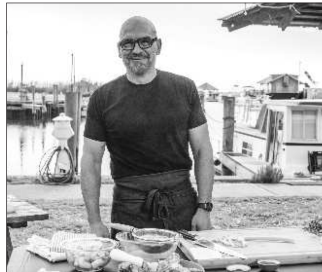
Michael Symon from "BBQ USA"

Chef Michael Symon heads to the bayous of Breaux Bridge, Louisiana, for Operation Smoke Sheaux, where the pits are lit and more than 60 teams smoke up for a share of $10,000. From chicken to brisket to spare ribs, it's a battle for mouthwatering meats.