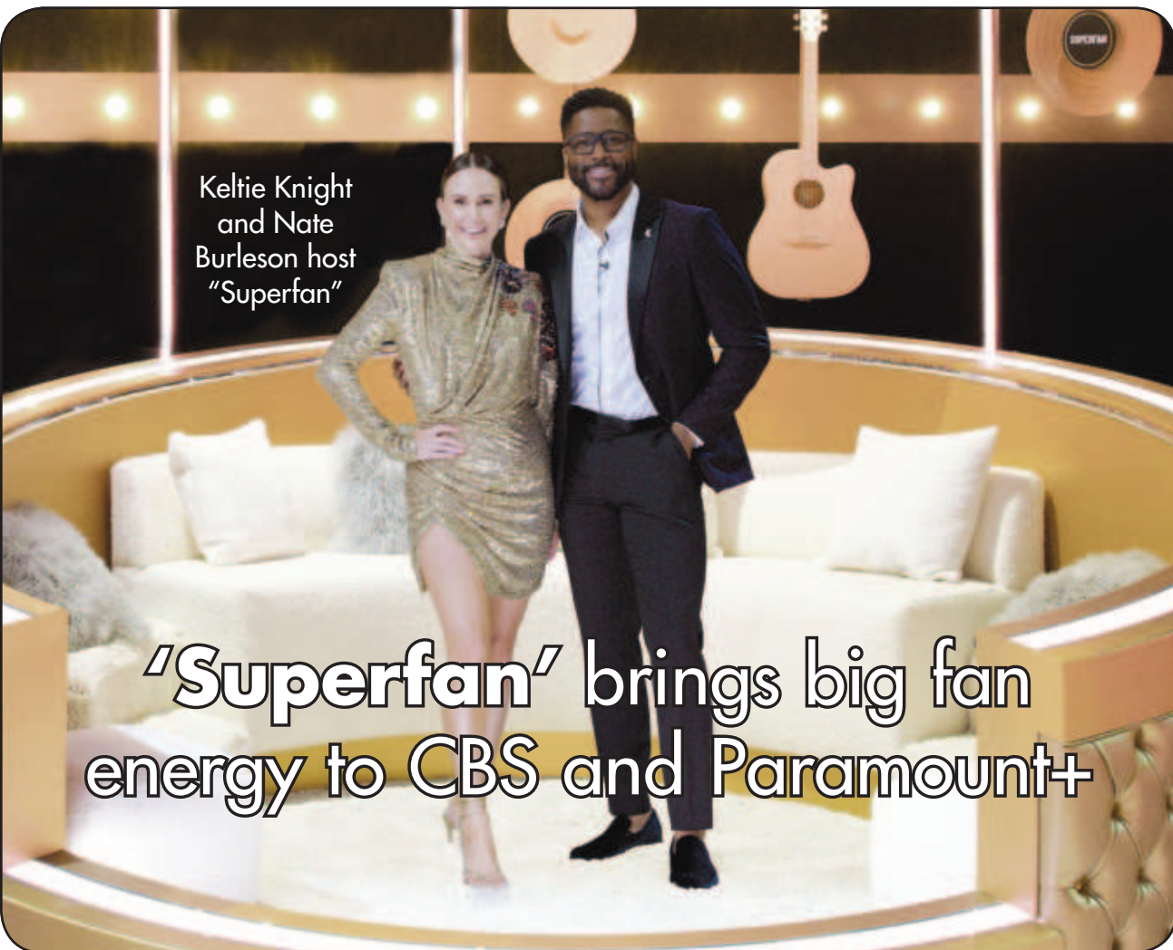
Keltie Knight and Nate Burleson host "Superfan"

TV Listings for the week of August 6 to August 12