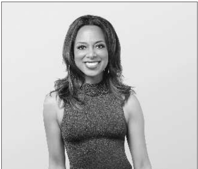
Nischelle Turner, host of "Secret Celebrity Renovation"

Lester Holt anchors this new episode, revisiting stories from NBC's renowned news-magazine. An exceptional feat of journalism and storytelling, the series pieces together real-life events to present a comprehensive picture of the case in question.