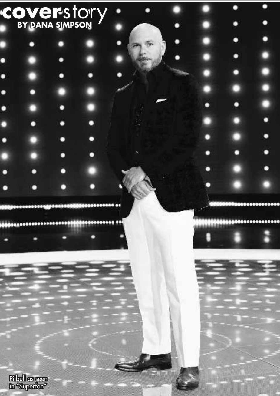
Pitbull as seen in "Superfan"