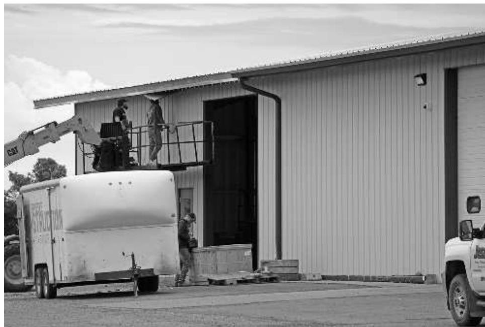
Jessen's Heating, Refrigeration Inc. & Electrical adding on an addition to their facility.