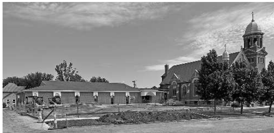
St. Bernards Catholic Church is having some construction done to put in parking to help members have access closer to the door and for drop offs.