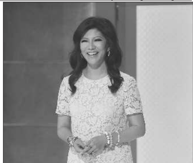
Julie Chen Moonves hosts "Big Brother"

It seems a building's rough history of lawless cowboys, cutthroat gamblers and exploited women powers a hateful energy that is awakened when the crew of paranormal investigators as they explore the Commercial Hotel and Casino in Elko, Nevada..