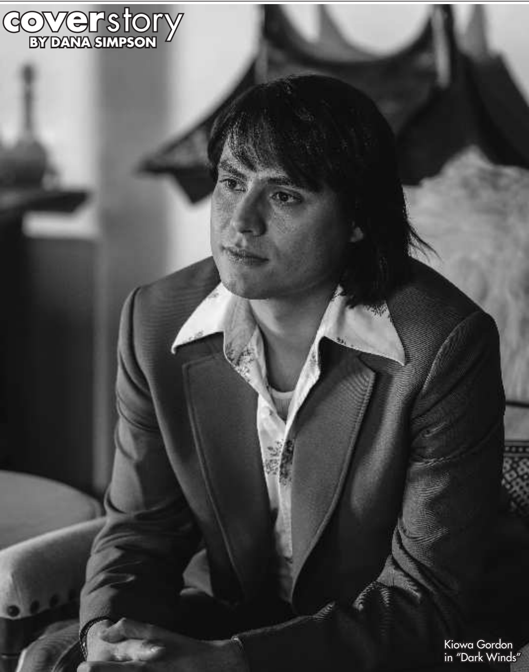
Kiowa Gordon in "Dark Winds"