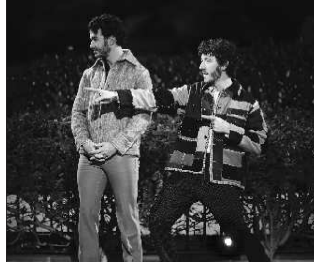
Kevin and Franklin Jonas host "Claim to Fame"

Another new episode airs tonight, as the remaining celebrity-adjacent contestants tackle new challenges while concealing their identity and lineage, all in the quest for their own fame and fortune.