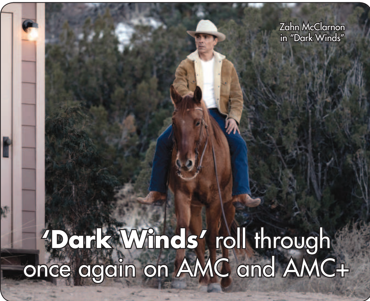
Zahn McClarnon in "Dark Winds"

TV Listings for the week of July 30 to August 5