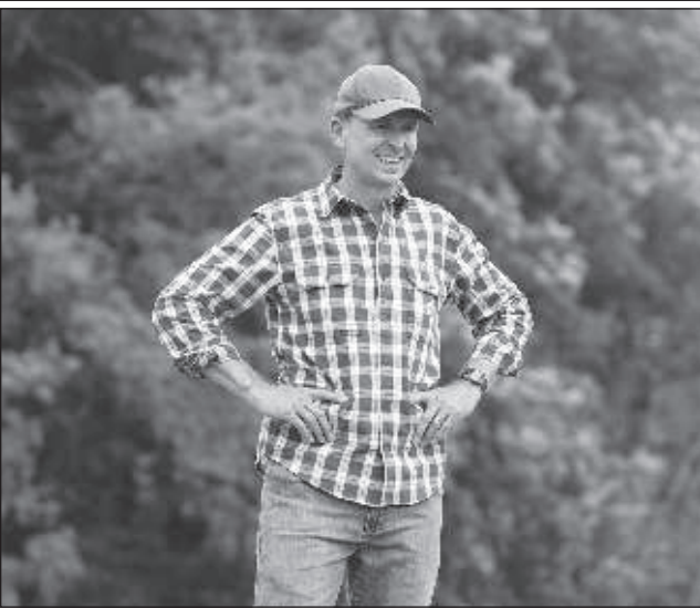
Phil Keoghan hosts "Tough as Nails"