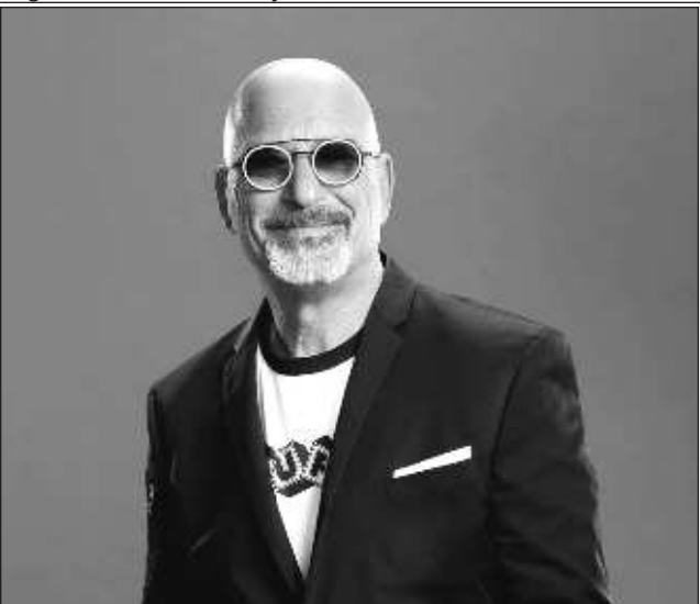
Howie Mandel from "America's Got Talent"