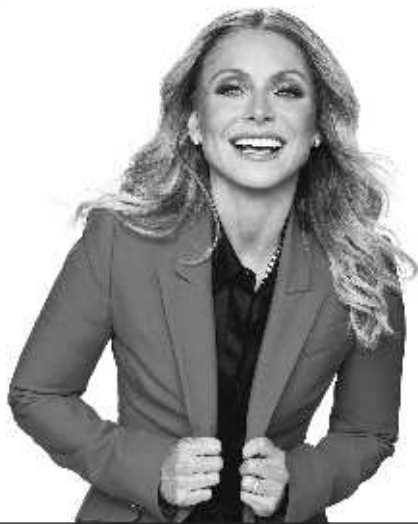
Kelly Ripa from "Generation Gap"