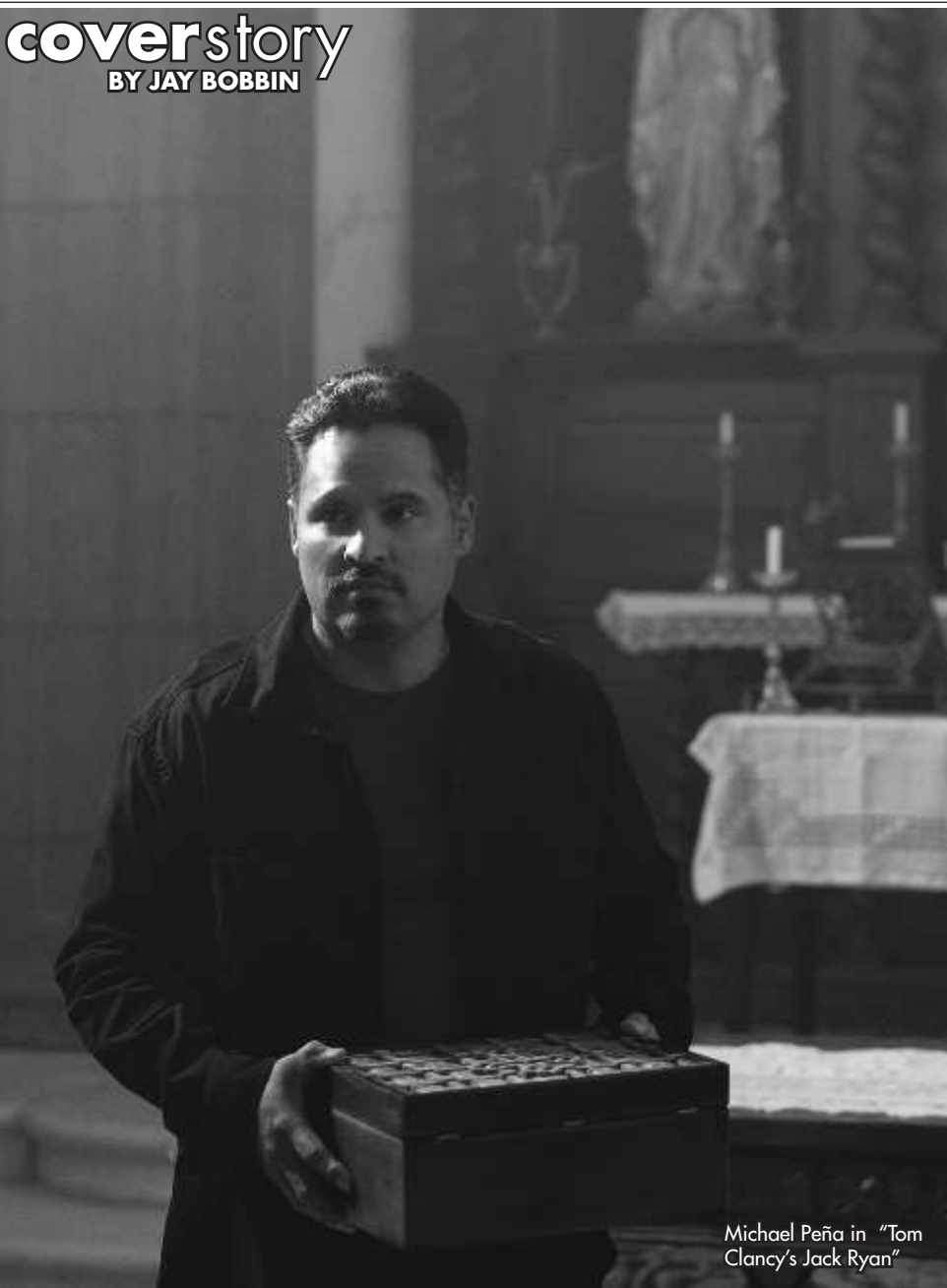
Michael Peña in "Tom Clancy's Jack Ryan"