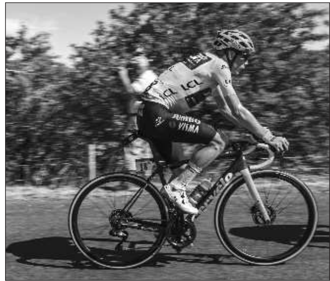
Defending Tour de France Champion, Jonas Vingegaard