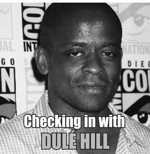
Checking in with DULÉ HILL

Dulé Hill has done a lot of television, but his current series is a well-known "Wonder."