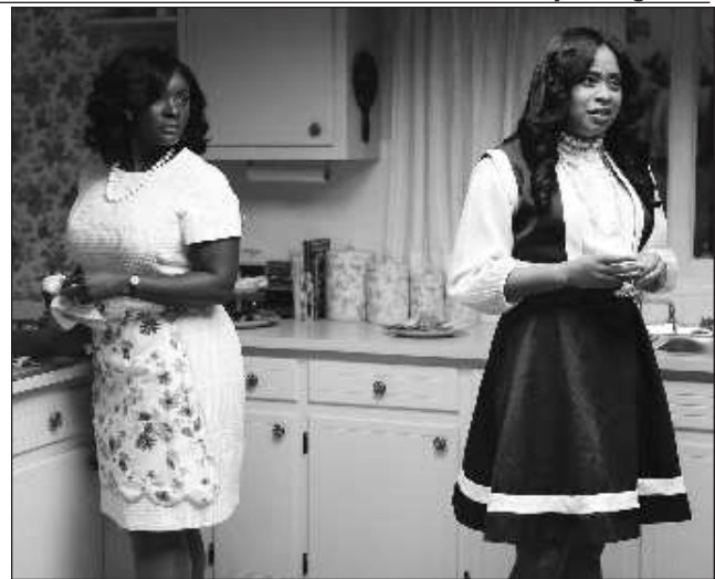
Saycon Sengbloh and Phoebe Robinson in "The Wonder Years"

A new episode airs from the fifth and final season of this "Sons of Anarchy" spinoff, which follows as Ezekiel "EZ" Reyes (J.D. Pardo) leads his brother Angel (Clayton Cardenas) and the members of the Mayans M.C. in a vicious turf war that ends it all.