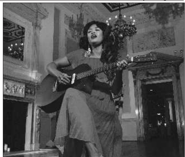
Valerie June in "The Articulate Hour"

In this series finale, creatives and experts explore and make sense of big ideas. Through conversations with artists, scholars, and other great creative thinkers, the flexibility of time is explored through a lens of arts, culture, and science.