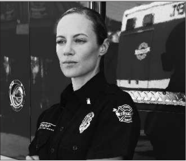
Danielle Savre stars in "Station 19" Thursday on ABC.