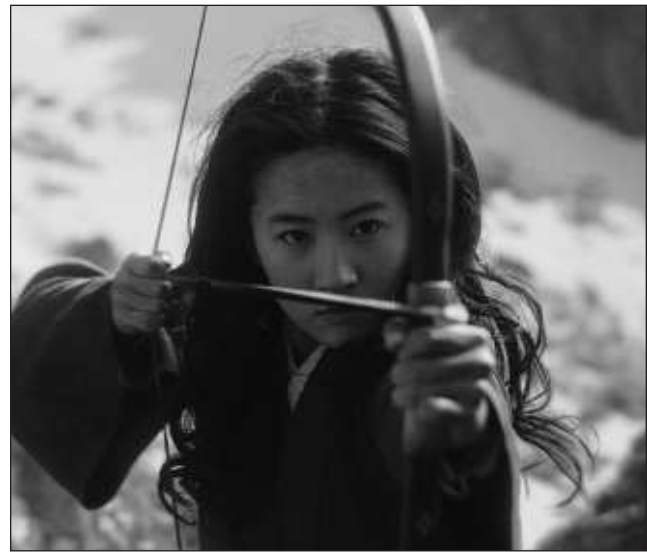
Liu Yifei stars in "Mulan" Saturday on FX.

When two young kids (Kirsten Dunst and Bradley Pierce) open the box to a magical board game, they release a man who's been trapped inside for decades (Robin Williams) ... along with a whole host of dangers, including wild animals and carnivorous plants. To save themselves and stop the chaos, now they must finish (and win) the game.