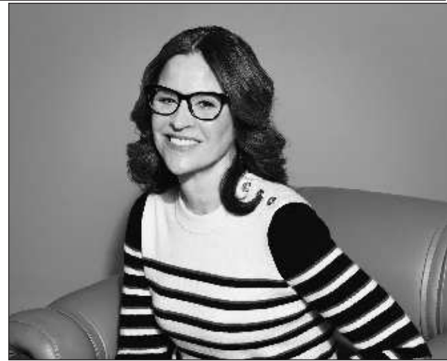
Ally Sheedy stars in "Single Drunk Female" Wednesday on Freeform.

Spin the wheel, beat the clock, guess the answer and play along through 80 years of game show history in this new series opener "The Answer Is ... ." Reflecting on the changing face of America, the show explores the contestants, hosts, creators, and scandals that encapsulate iconic game shows. This episode examines the quiz show and how its format has changed over the years. Michael Strahan, Sara Haines, Jay Leno, and Sherri Shepard are featured.