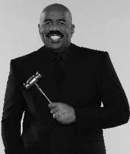
"Judge Steve Harvey" airs Tuesday on ABC.