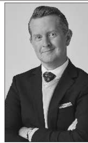
Ken Jennings hosts "Jeopardy! Masters Monday on ABC."

When in doubt, move out! After nearly two decades, a family's house has grown outdated and dysfunctional and now finds itself on an increasingly busy street intersection. She thinks real estate agent David Visentin can find a better layout in a quieter location, but he wants Hilary Farr to work her magic and turn the home into something they'll love again in the new episode "Intersection of Loud and Dated."