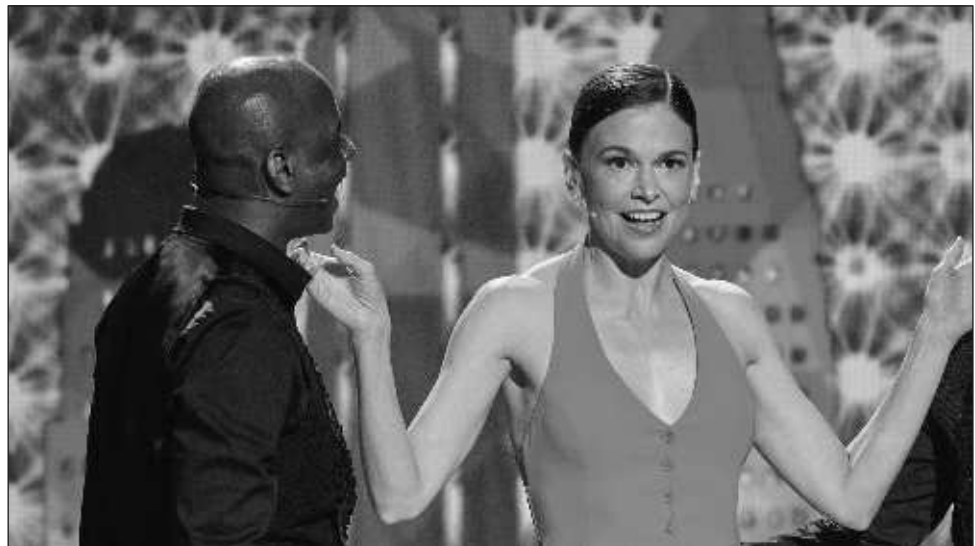
Sutton Foster hosts a new "Great Performances" Friday on PBS (check local listings).

Loosely based on director Steven Spielberg's childhood growing up in post-World War II era Arizona, a young man named Sammy Fabelman (Gabriel LaBelle) aspires to become a filmmaker as he reaches adolescence and discovers a shattering family secret. He explores how the power of movies helps us see the truth about each other and ourselves in this 2022 drama.