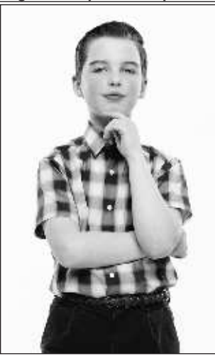
Ian Armitage stars in "Young Sheldon" Thursday on CBS.