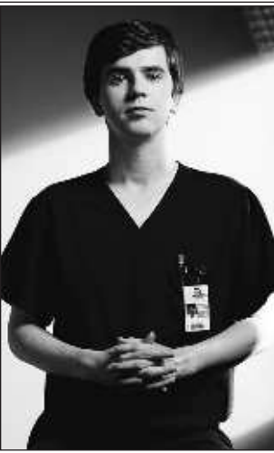
Freddie Highmore stars in "The Good Doctor" Monday on ABC.