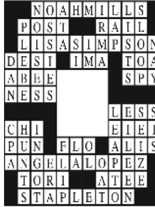
Solution Gerald McRaney