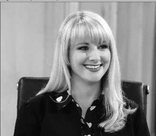
Melissa Rauch stars in "Night Court" Tuesday on NBC.