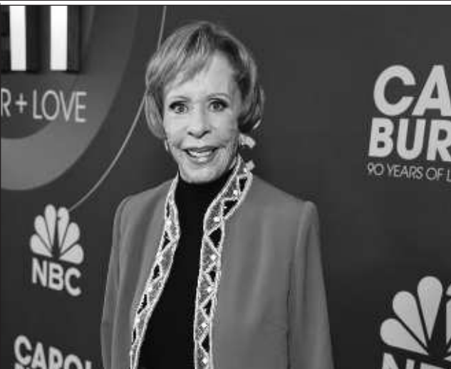
“Carol Burnett: 90 Years of Laughter + Love” airs Wednesday on NBC.