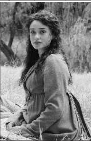
Rose Williams stars in "Sanditon on Masterpiece" Sunday on PBS (check local listings).