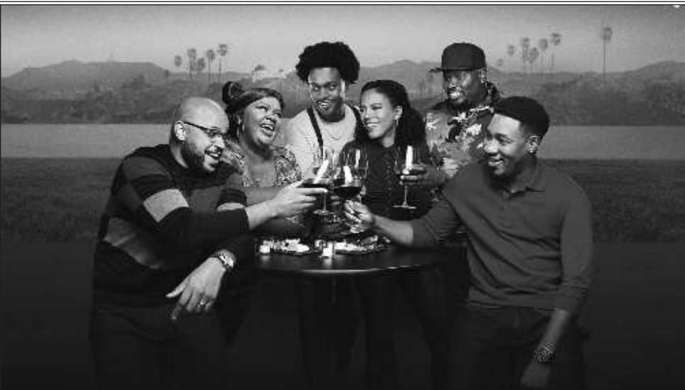
The cast of "Grand Crew" Friday on NBC.