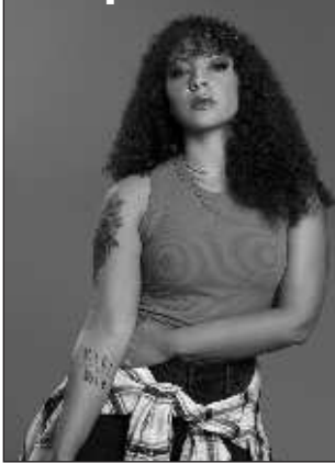
Jasmine Cephas Jones

Friday 7 p.m. on (29); 11:01 p.m. on (29)