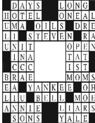
Solution Kylie Bunbury