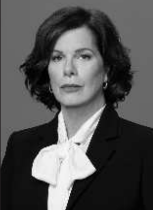
Marcia Gay Harden