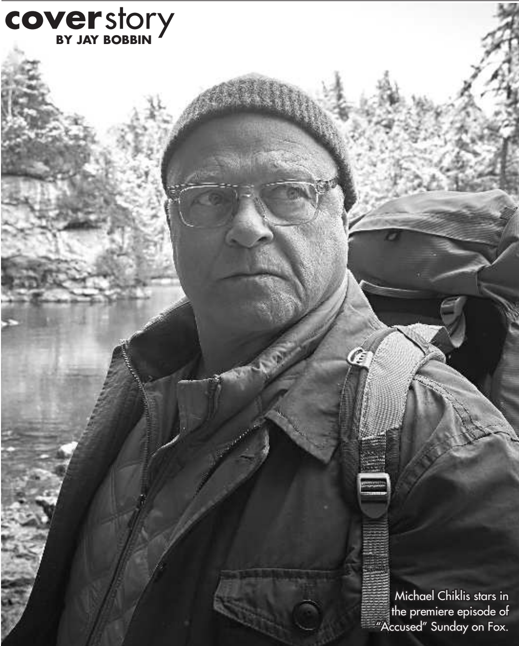
Michael Chiklis stars in the premiere episode of "Accused" Sunday on Fox.