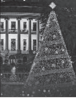
"National Christmas Tree Lighting: Celebrating 100 Years"

Sunday 7 p.m. on 3 (3) National Christmas Tree Lighting: Celebrating 100 Years Wrap yourself in tinsel and put on your head, it's time to light up the holidays with this beloved American tradition, now in its 100th year, and presented by the National Park Service and National Park Foundation. Tune in to celebrate the official tree lighting on the Ellipse in President's Park in Washington, D.C., and experience an all-star lineup of musical performances with the whole family from the comfort of your home.