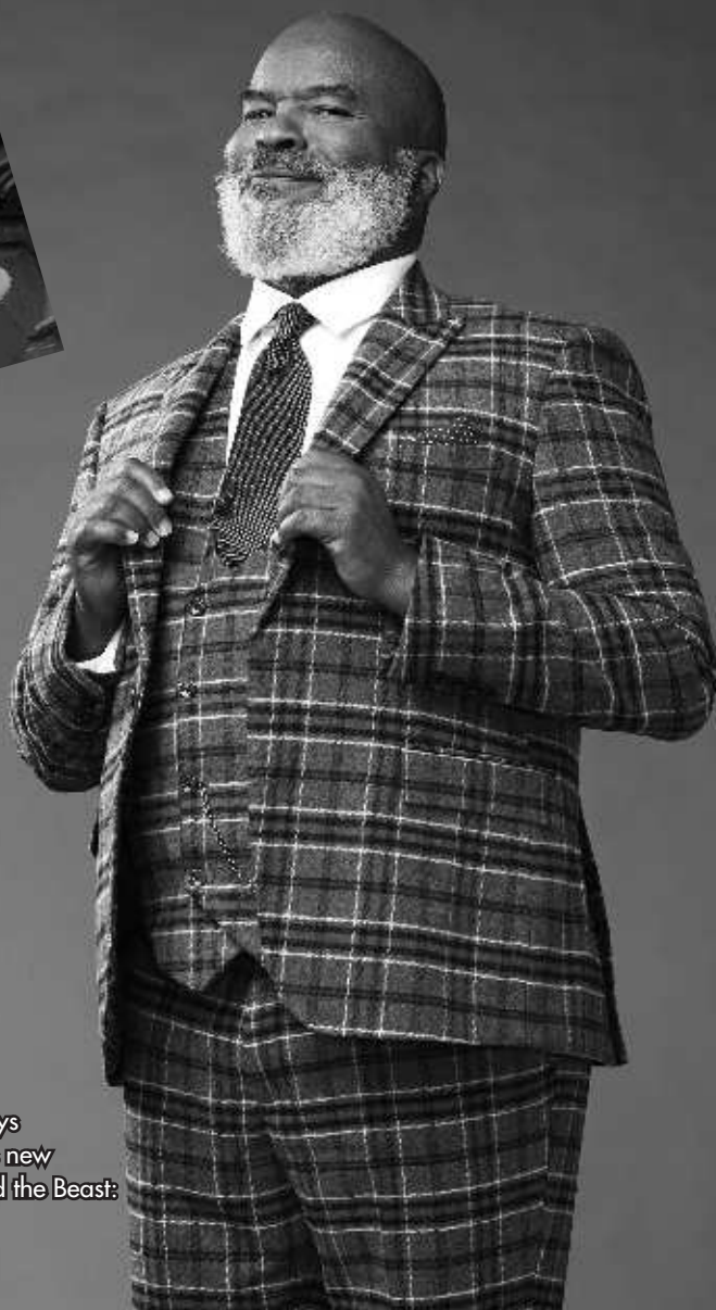
David Alan Grier portrays Cogsworth in Thursday's new ABC special "Beauty and the Beast: A 30th Celebration."