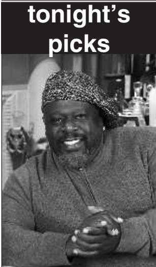
Cedric the Entertainer