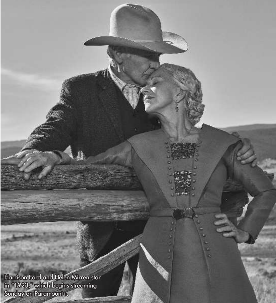
Harrison Ford and Helen Mirren star in "1923," which begins streaming Sunday on Paramount+.