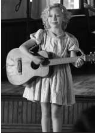
Alivia Alyn Lind

7 a.m. on 29 ; 7 p.m. on 29 ; 11:59 p.m. on 29