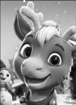
"Reindeer in Here"