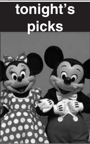
"The Wonderful World of Disney: Magical Holiday Celebration"

Sunday 7 p.m. on 9 9 The Wonderful World of Disney: Magical Holiday Celebration What do you get when you mix the happiest place on earth with the most wonderful time of the year? You get the Magic Kingdom's perfect interpretation of the season. The ABC holiday season staple returns for its seventh year with a dazzling array of all-new musical performances from top musicians providing their renditions of Christmas carols and holiday favorites.