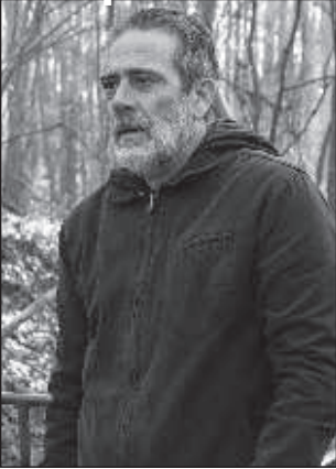
Jeffrey Dean Morgan