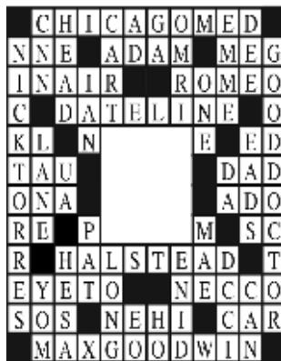
Solution Susan Sarandon