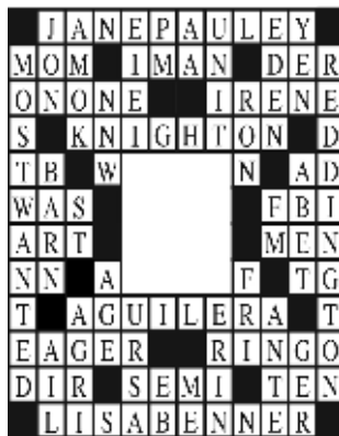
Solution Jerry Stiller