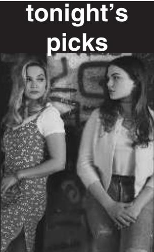
Chiara Aurelia (left) and Olivia Holt