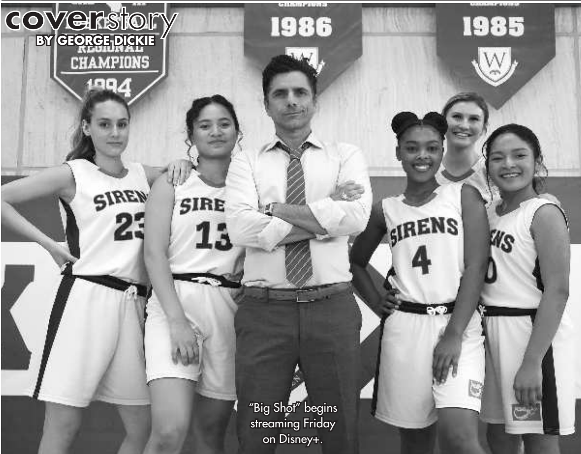
"Big Shot" begins streaming Friday on Disney+.