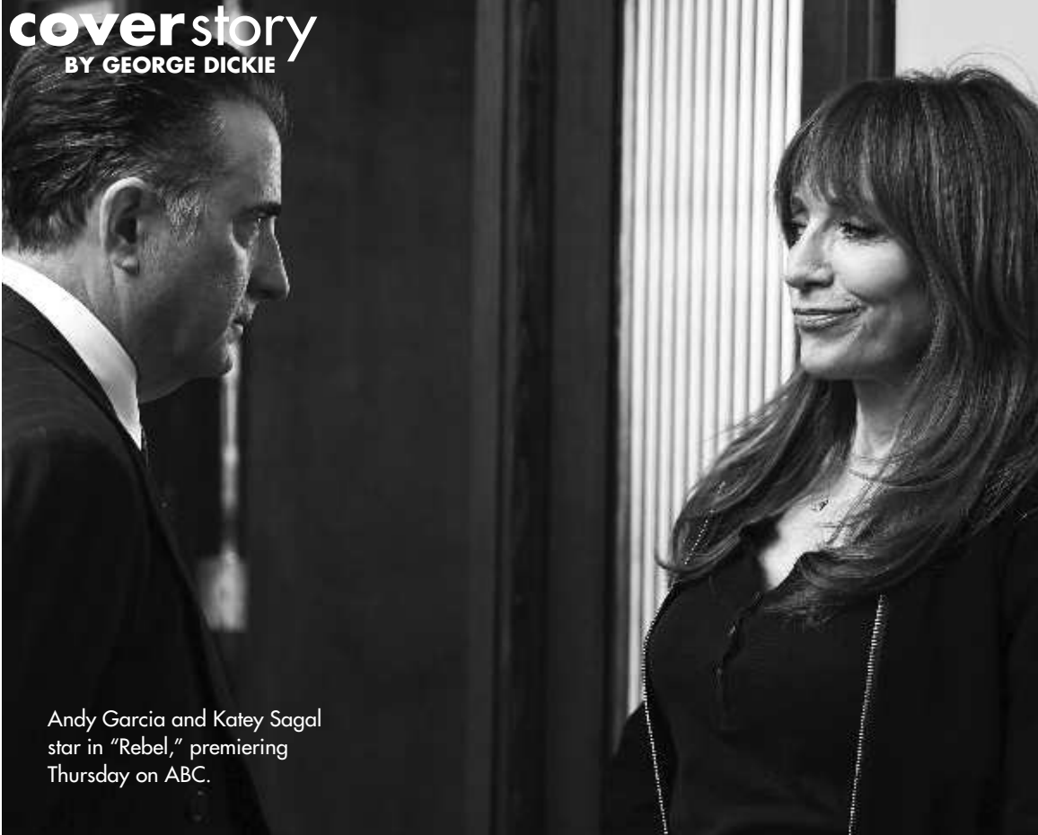
Andy Garcia and Katey Sagal star in "Rebel," premiering Thursday on ABC.

Annie "Rebel" Bello is the kind of woman you want on your side in a street fight.