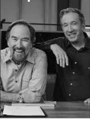
Richard Karn (left) and Tim Allen