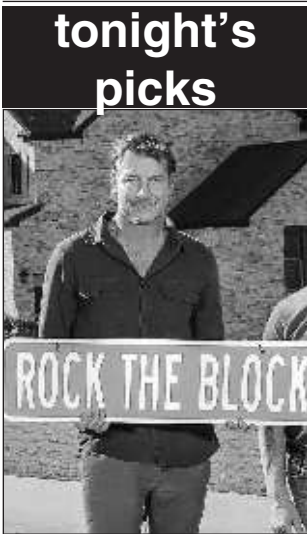
"Rock the Block"