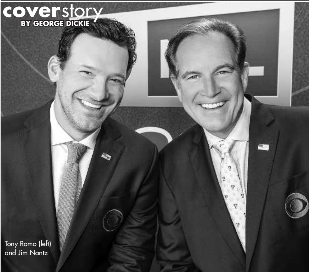
Tony Romo (left) and Jim Nantz