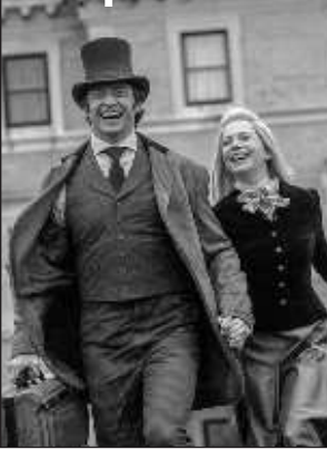
Hugh Jackman and Michelle Williams

Thursday 1 p.m. on (182); 3:45 p.m. on (182); 6:30 p.m. on (182); 9:15 p.m. on (182); 12 a.m. on (182); 2:45 a.m. on (182); 5:30 a.m. on (182)