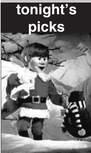
"Santa Claus Is Comin' to Town"