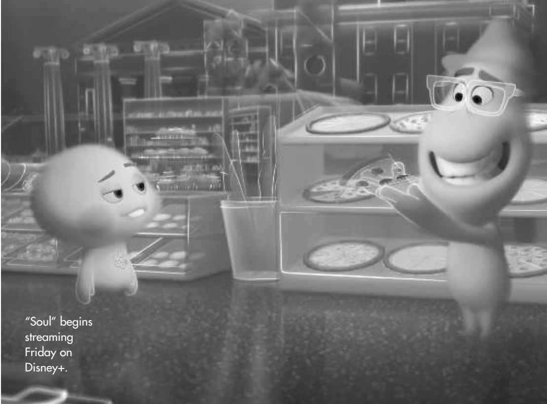
"Soul" begins streaming Friday on Disney+.

We've all imagined what a human soul might look like. But Disney+ makes it the centerpiece of a storyline in an animated film that begins streaming Christmas Day, Friday, Dec. 25.