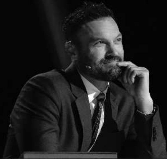
Brian Austin Green is a panelist as "The Masked Singer" premieres Sunday on Fox.