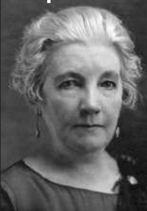
Laura Ingalls Wilder