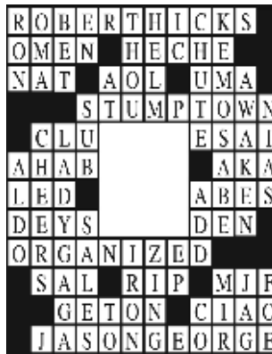
Solution Robin Williams