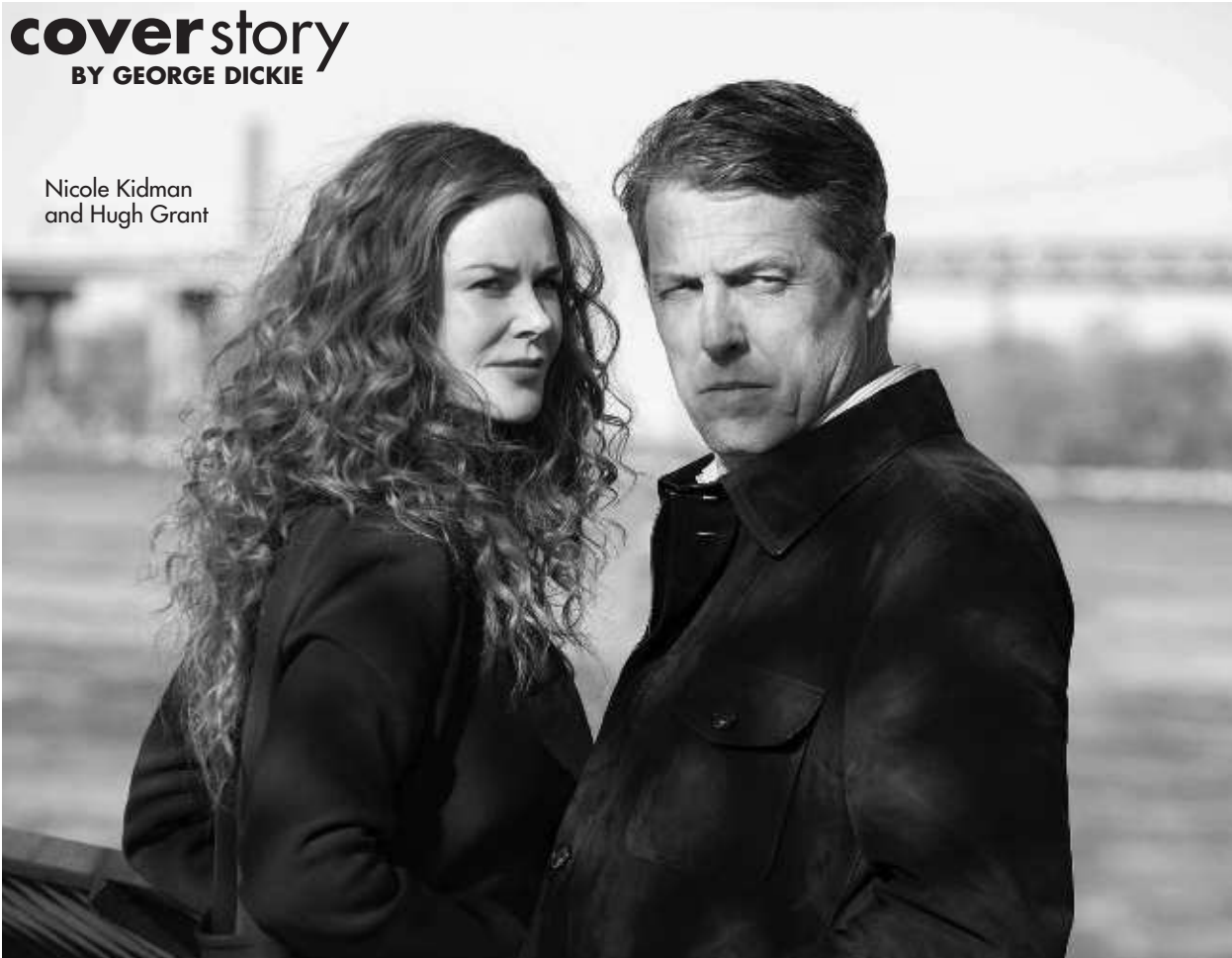
Nicole Kidman and Hugh Grant