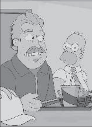
Mr. Burns (left) and Homer

Sunday 7 p.m. on 12 7 The Simpsons Season 32 of this satirical animated comedy sends up a certain reality series on another network in the season premiere "Undercover Burns," which finds Mr. Burns (voice of Harry Shearer) going undercover at the nuclear power plant as "Fred," a new employee. Much to his surprise, Homer (voice of Dan Castellaneta) and the gang make him feel welcome, and soon "Fred" is putting in new amenities to please his new amenities. That doesn't sit well with the jealous Smithers (Shearer again), however. Guest voices include David Harbour ("Stranger Things") and Phil Rosenthal (as himself).