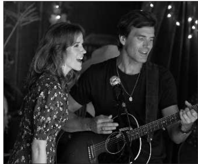
Jessy Schram and Lucas Bryant