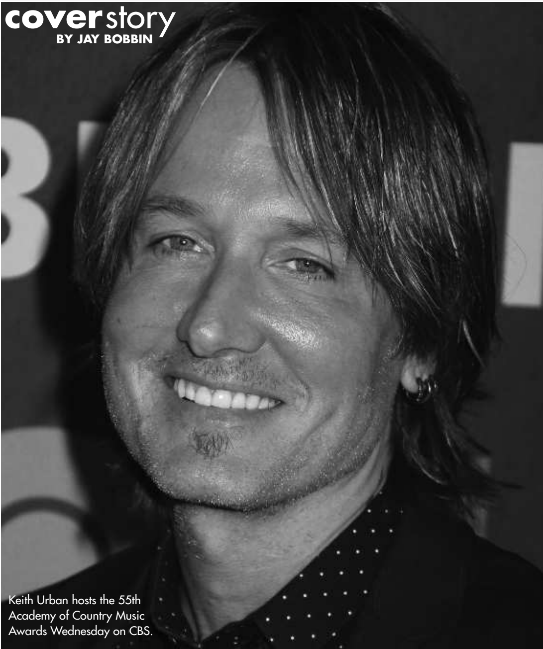
Keith Urban hosts the 55th Academy of Country Music Awards Wednesday on CBS.