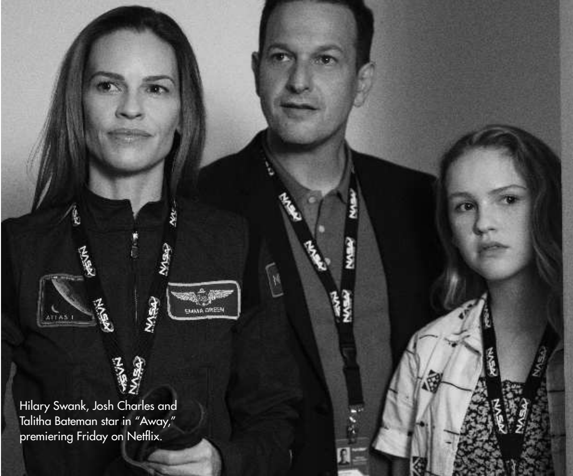
Hilary Swank, Josh Charles and Talitha Bateman star in "Away," premiering Friday on Netflix.

Space may not be the final frontier for Hilary Swank, but it certainly is her next one.