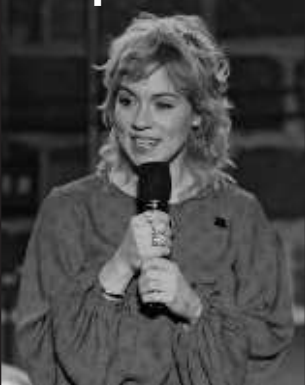
"Alice Wetterlund: My Mama Is a Human and So Am I"

Tuesday 7 p.m. on 56 Movie: My Journey Through French Cinema