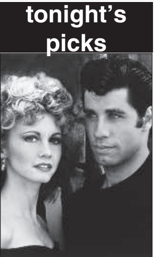
Olivia Newton-John and John Travolta