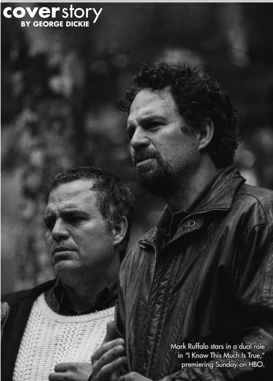
Mark Ruffalo stars in a dual role in "I Know This Much Is True," premiering Sunday on HBO.