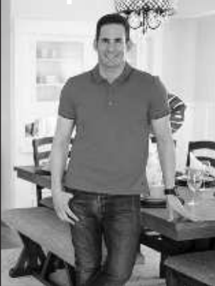
"Flipping 101 With Tarek El Moussa"

Thursday 7 p.m. on 3 3 Young Sheldon Sheldon (Iain Armitage) has a true scientific epiphany while at the dentist's office in the new episode "A Baby Tooth and the Egyptian God of Knowledge." Elsewhere, Dale and Meemaw (Craig T. Nelson, Annie Potts) go to a casino, but Georgie (Montana Jordan) makes a huge mistake while Dale leaves him minding the store. Wallace Shawn, Sarah Baker and Ryan Stiles guest star; Zoe Perry and Lance Barber also star.