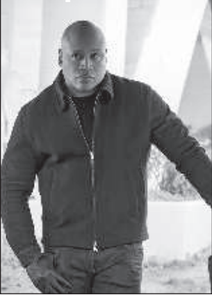
LL Cool J