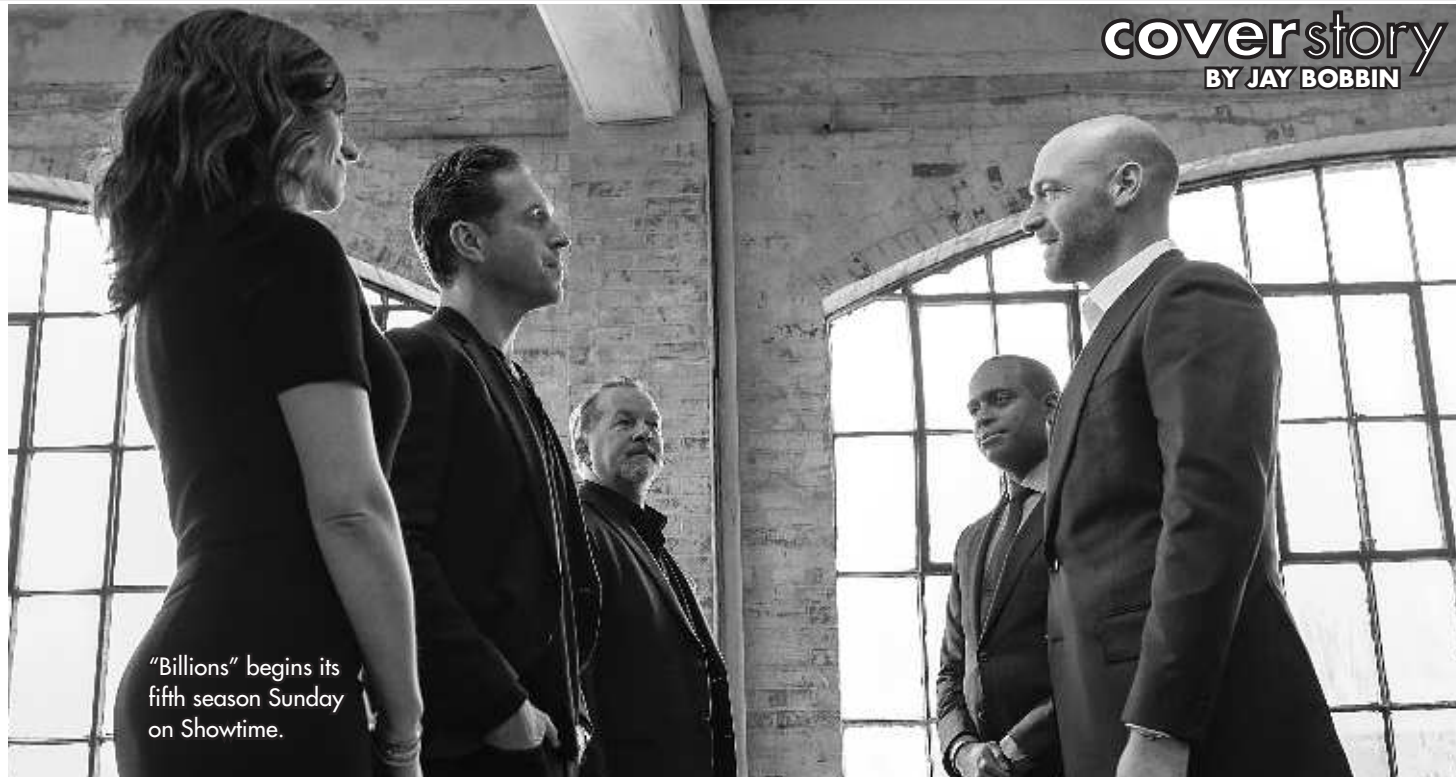
"Billions" begins its fifth season Sunday on Showtime.

"Billions" is about to give Maggie Siff a considerable payoff.