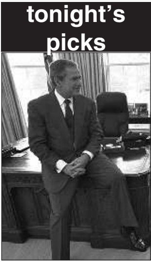
George W. Bush