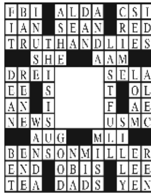
Solution Debra Messing