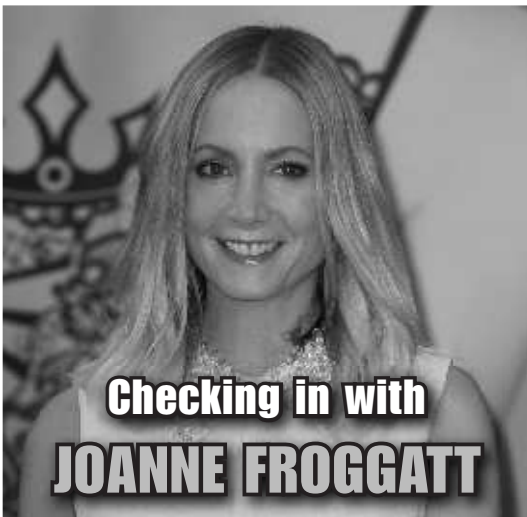
Checking in with JOANNE FROGGATT

Other TV credits include: "Coronation Street," "Bad Girls," "Paradise Heights," "Island at War," "Life on Mars" (U.K.), "Robin Hood," "Downton Abbey," "Dark Angel," "Bob the Builder" (voice), "The Commons" (Australia)