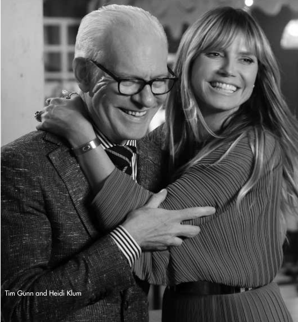
Tim Gunn and Heidi Klum