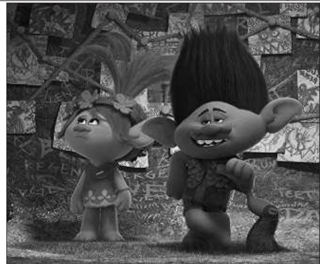
Poppy (left) and Branch

Deadshot, Harley Quinn, Captain Boomerang and Killer Croc team up with several other armed supervillains to take on a mysterious adversary, while the psychopathic Joker launches an insidious agenda of his own in this 2016 DC superhero release, which was slammed across the board by critics. That didn't stop the film from raking it in at the box office, as well as picking up an Academy Award for best makeup. Jared Leto, Will Smith, Margot Robbie and Viola Davis star.