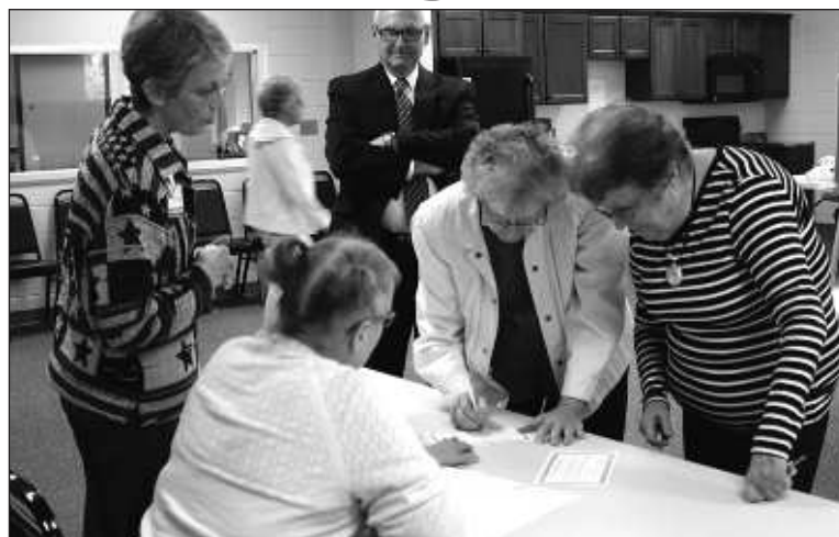
Election workers assist voters wishing to cast a ballot in the wheel-tax referral election. Turnout was light for the special election, in which an increase in the wheel tax was overturned.

Commissioners had adopted a revised ordinance during the summer that would have raised the tax from $2 per wheel to the maximum $5 per wheel. It also would have increased the number of wheels to be taxed from four to a