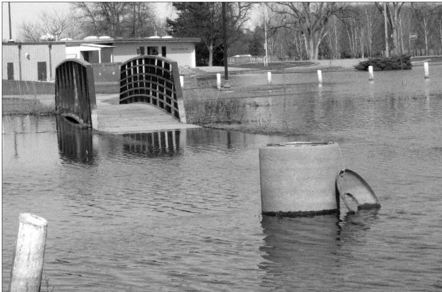
Above: This photo, taken in April 2010, shows flooding at Ravine Lake Park and the former municipal swimming pool.

Another 113 soldiers from the South Dakota Army National Guard's 211st Engineer Company (Sapper) were welcomed home to De Smet and Madison after serving in Afghanistan. The unit had been stationed in Afghanistan for one year in support