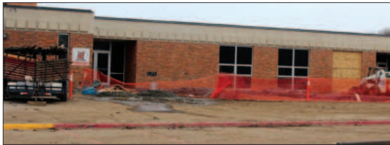
Work continues on a new entrance at Huron High School to offer better security.

Major storms in late July and early August dumped more than five inches of rain and came with severe high