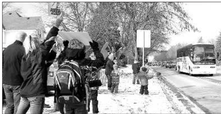
Fans welcome home the Huron Tiger football team after it played at the DakotaDome in Vermillion.

The company is owned by 43 Hutterite colonies in the Dakotas and Minnesota. The new plant was originally a 50,000-square-foot speculative building constructed by Greater Huron Development Corporation. Dakota Provisions purchased it and added 20,000 square feet.