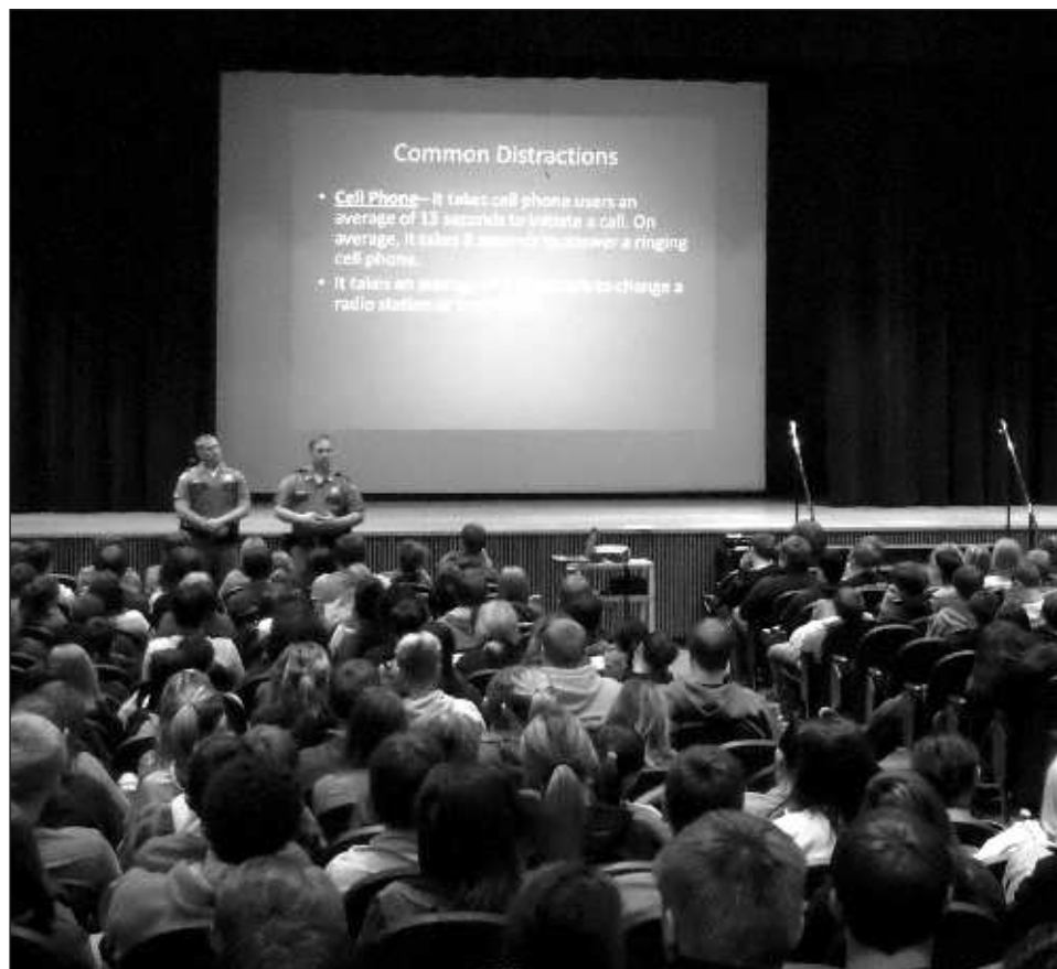
Law enforcement personnel present a program on the dangers of using cell phones and texting while driving to a large crowd in April 2012 at Huron High School.

• In a program applauded by a number of residents, the City Com-