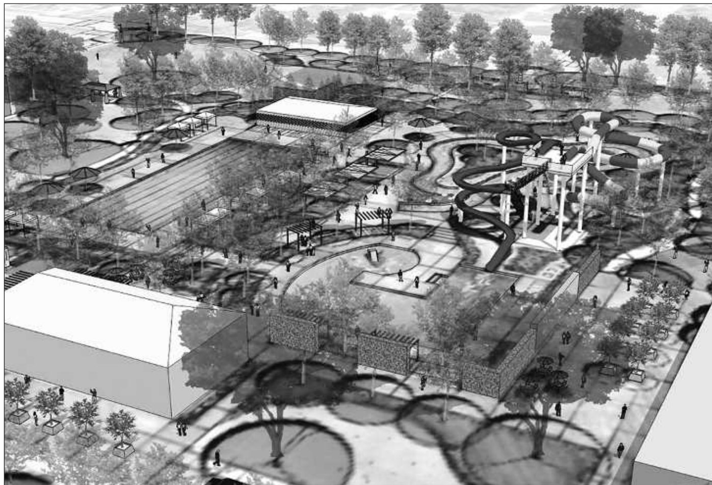
This artist rendition shows the Central Park area with the Splash Central Waterpark which was built in 2011 and completed in the spring of 2012. The $12.6 million project brought this state-of-the-art aquatic center to Huron, resolving the six-year-old dilemma of what to do with deteriorating buildings on the former Huron University Campus.

After a number of public meetings to explain components of the project and to answer questions, the public showed its