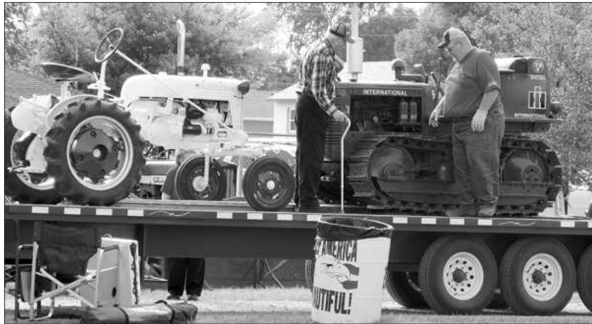
Huron hosted the 25th annual Red Power Roundup in June 2014 at the State Fairgrounds. More than 200,000 from around the United States and a number of foreign countries participated in the event, staged by the International Harvester Collectors Club. The club also donated $50,000 to the building of the Nordby Exhibit Hall for 4-H, which was then near its goal of raising $4 million for construction.

In a beginning project, the city is asking the state to pay