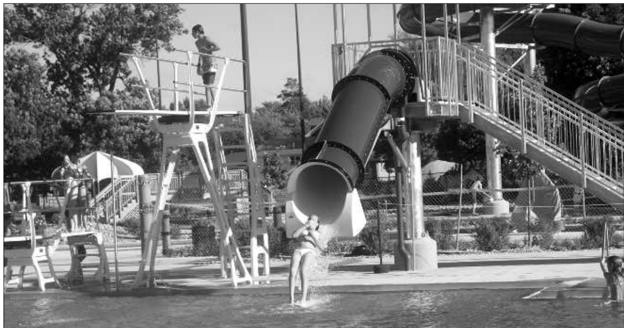
Splash Central at Huron's new Central Park opened in June to a throng of eager people of all ages.

Engraved names of veterans who have served their country