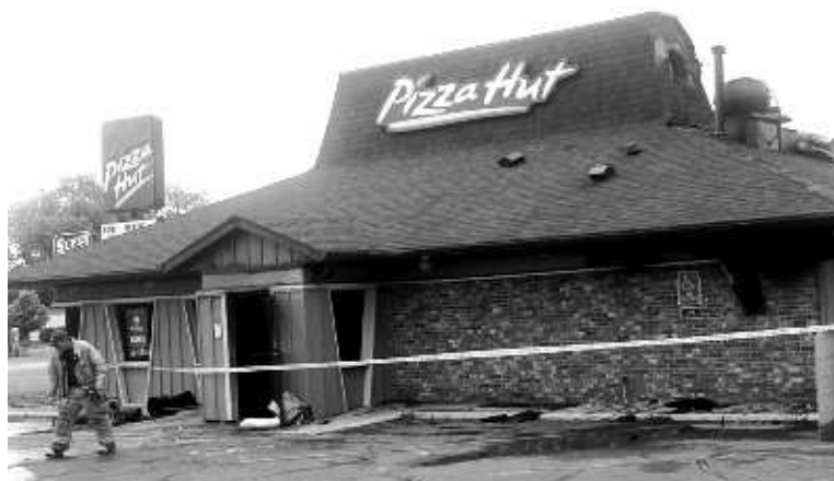
The Pizza Hut was destroyed by fire in the spring of 2016.

• In late September, the City Commission voted unanimously to approve a conditional use permit to allow Dakota Provisions to op-