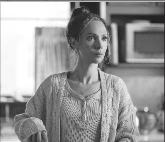
Juno Temple stars in " Fargo "