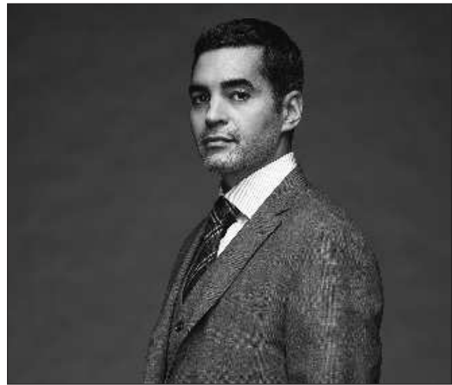
Ramón Rodríguez stars in "Will Trent"

Five-time Grammy Award-winning musician Robert Glasper, newly-nominated for a pair of 2024 Grammy Awards, brings his acclaimed "Black Radio" album to the ACL stage and is joined by jazz duo DOMi and JD BECK, who are making their ACL debut.