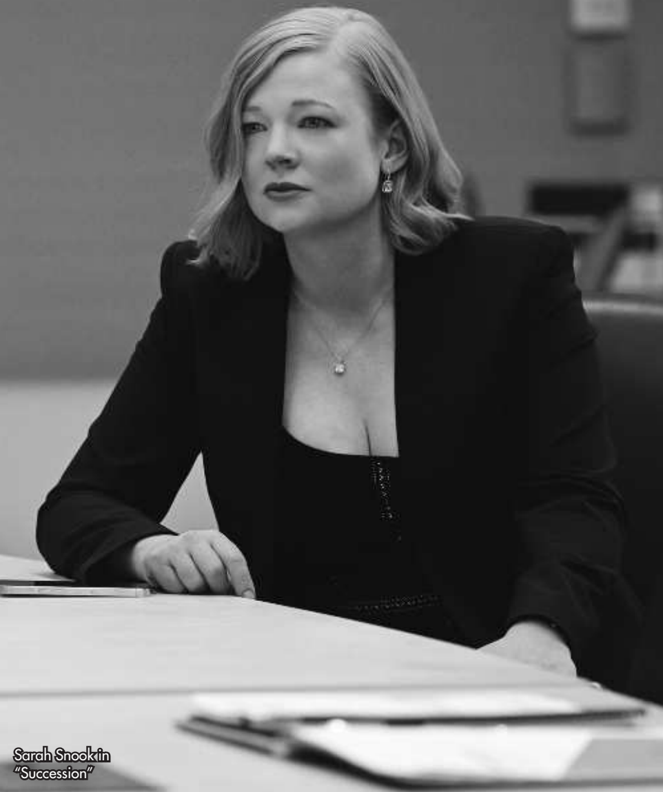
Sarah Snook in "Succession"