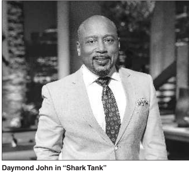
Daymond John in "Shark Tank"

Comedian Bill Maher returns to host the Season 21 premiere of his comedy/talk series, bringing his unique outlook on the issues of the day with a panel of diverse guests, featuring lively takes on current events, pop culture and politics.