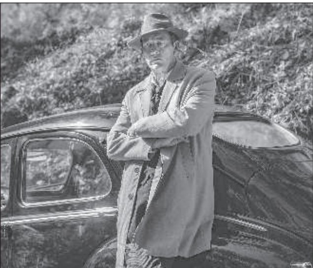
Clive Owen stars in "Monsieur Spade"