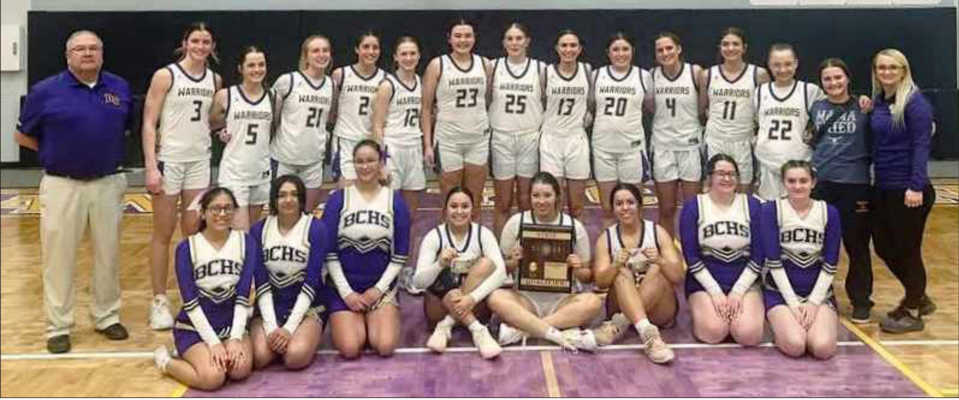
The Bennett County Lady Warriors celebrate their SoDak 16 victory.

The Bennett County Lady Warriors return to the Class “B” State Tournament for the first time in 40 years, making their last appearance in the State B’s in 1984. The school, located in Martin, will be making its seventh appearance in any state tournament, having made their last three appearances in the Class “A” tourney, winning a title in 1986. The Lady Warriors have only lost twice this year, and both losses were to eventual state tournament teams, Dakota Valley, the second seed in Class A, and Lyman, the third seed in Class B. Bennett County is one of few