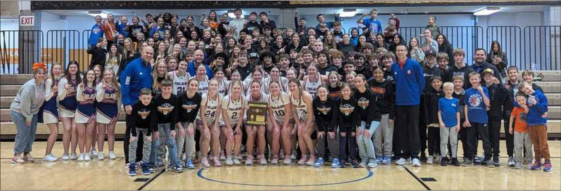
The Parkson Trojans players, cheerleaders, coaches, and a host of fans pose after their SoDak 16 victory at the Corn Palace in Mitchell.

The Parkston Trojans return to the Class “B” State Tournament for the first time since 1981 as the fourth seed in the 2025 tourney. The Trojans appeared nine times in the Class “A” tournament between appearances in the Class “B” tourney, with their best showing a runner-up finish in the 2012 A tournament. The Trojans have played a schedule littered with top-tier teams this sea-