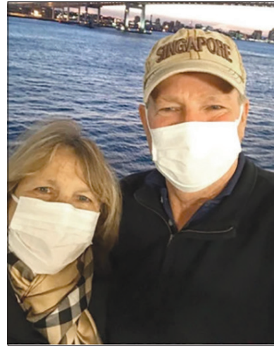
Special to The Prairie Press

Donors like Berrent and the Haerings are needed to supply the building blocks of potentially lifesaving treatments. Rich