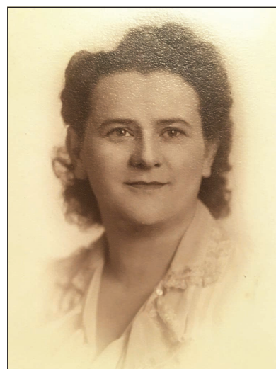
Special to The Prairie Press